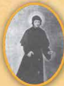
Elizabeth Ann Seton Co-Patroness