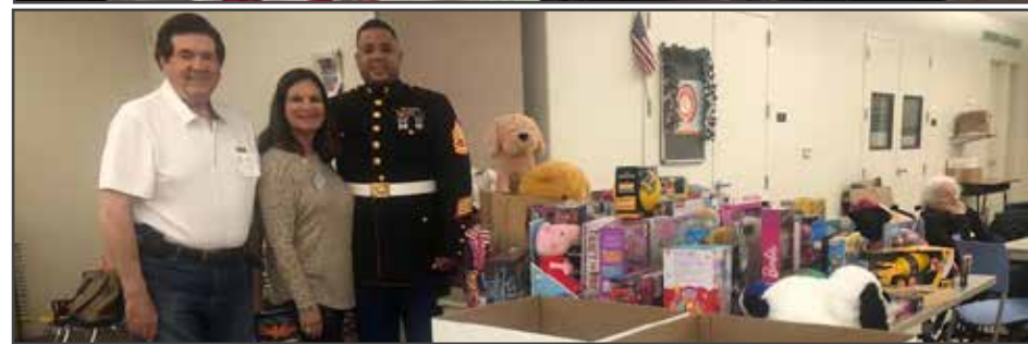
Br. 214 members involved in meetings