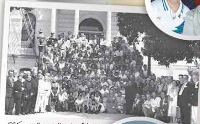
ICF 1932 Convention in Gilroy