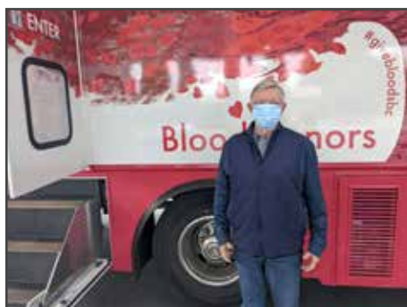
Br. 408 Blood Drive