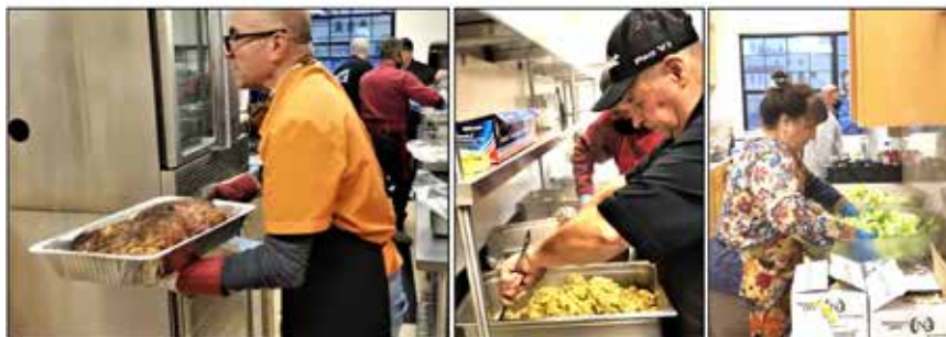
Turkeys are out of the oven