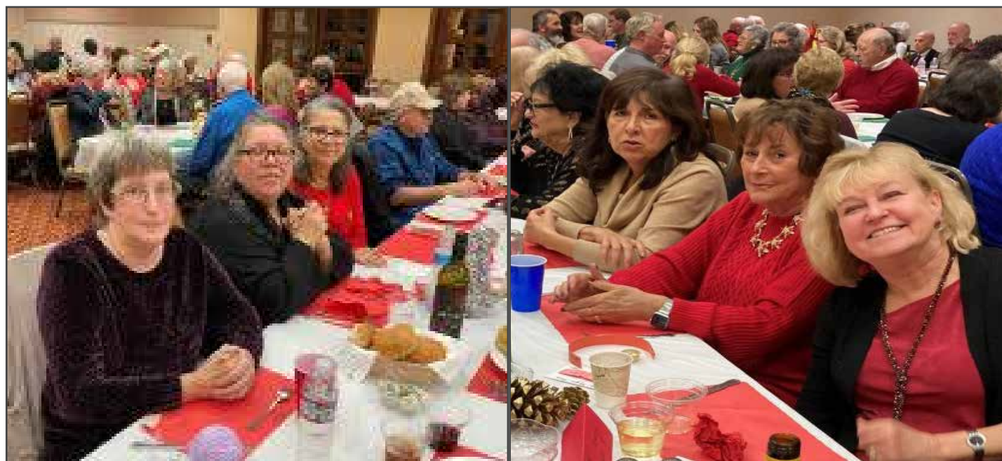
Br. 36 Christmas Party