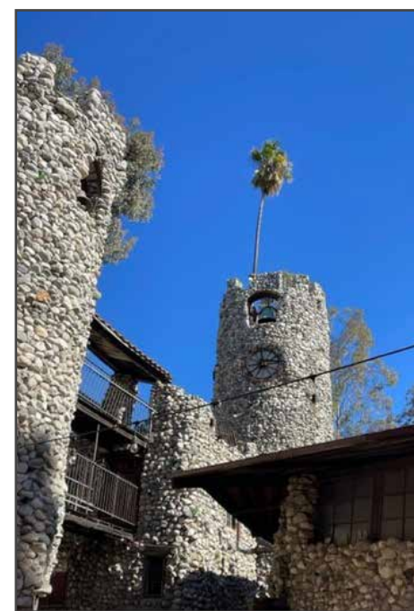
Br. 179 visit to Rubel Castle. More pictures on next page.