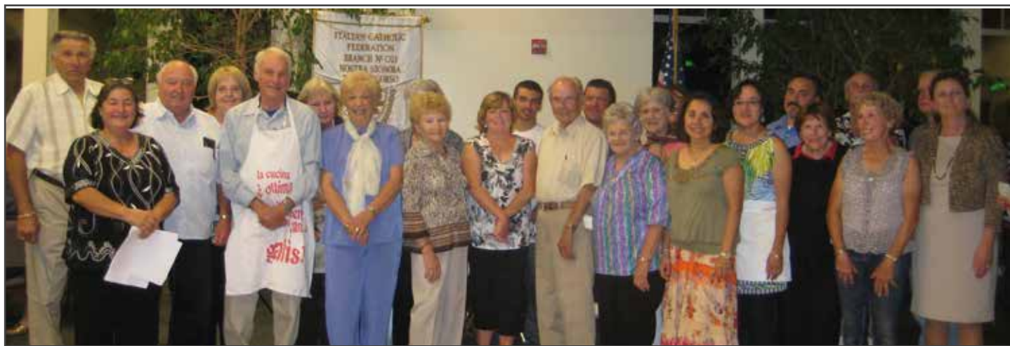
Br. 21 Calamari Dinner

December 6, we had over 250 members and guest at our Christmas dinner. Three course dinner was served;