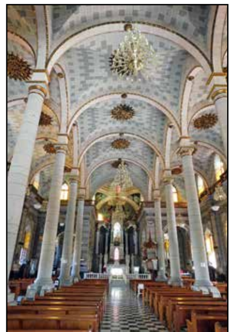
Cathedral of the Immaculate Conception in Mazatlan