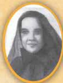
Frances X. Cabrini Co-Patroness