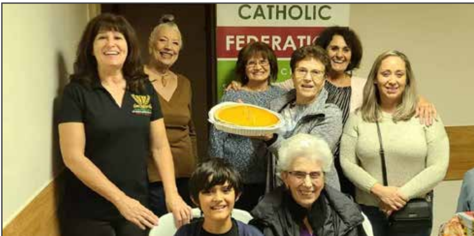
Br. 111, Members' birthdays

General Contractors Construction Management Design/Build Services