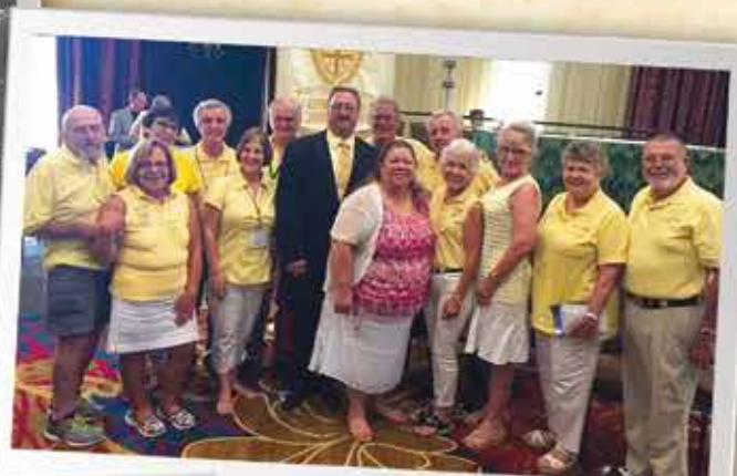
Convention Branch 28