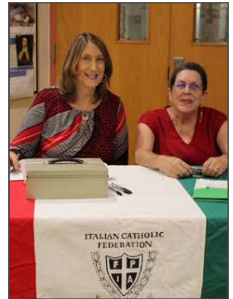
Br. 449 Italian Feast fundraiser for Cooley's Anemia