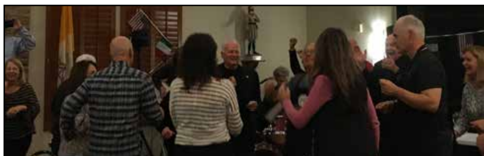
Br. 352, Italian Heritage Dinner

(Check out next page for additional photos.)