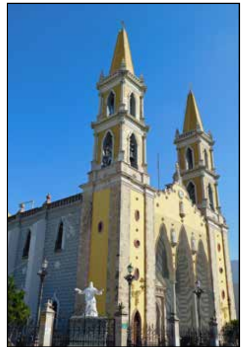
Cathedral of the Immaculate Conception in Mazatlan