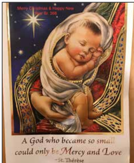
Merry Christmas & Happy New Year from Br. 368