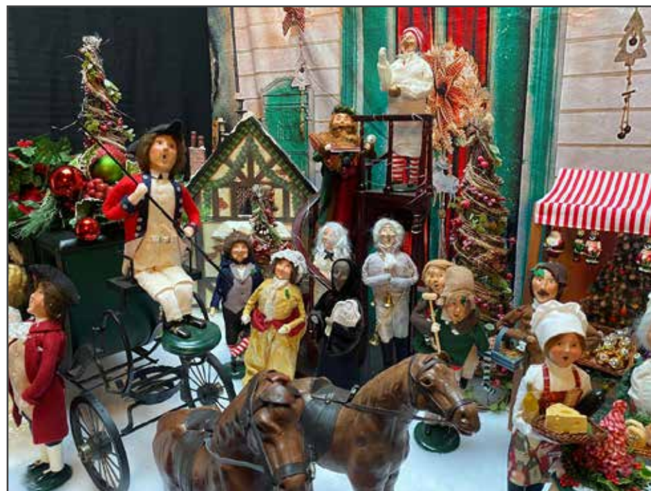
Br. 184 Open House