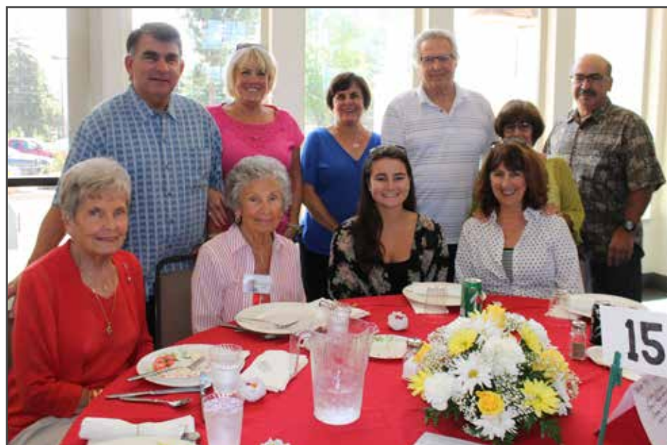
Br. 21 - 90 Year Olds' Festa

(Check out next page for additional photos.)