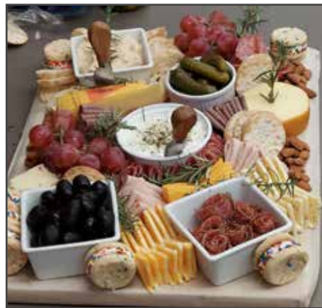
Br. 82, The finished Charcuterie Board