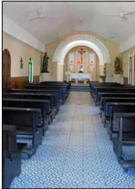
Church of Saint Luke in Cabo San Lucas