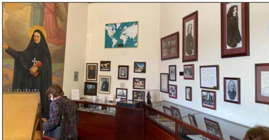
Members of branch 115 enjoying Mother Cabrini outing