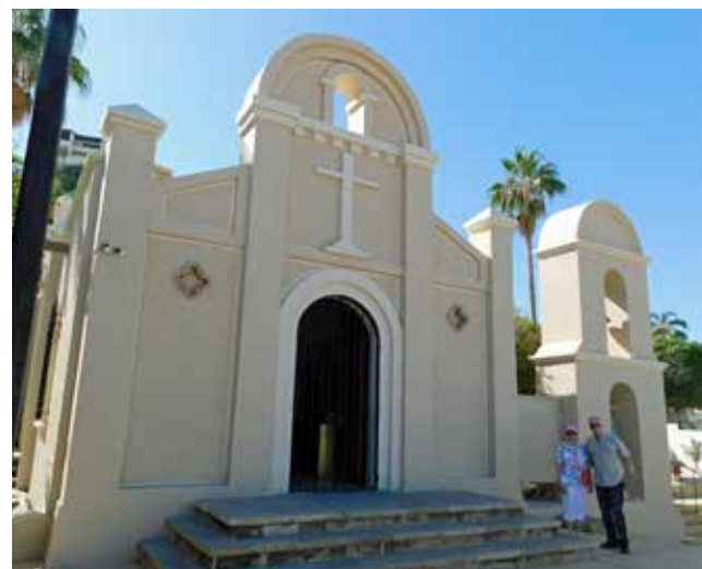
Church of Saint Luke in Cabo San Lucas

The first one is in Cabo San Lucas and it is the Church of Saint Luke. The church