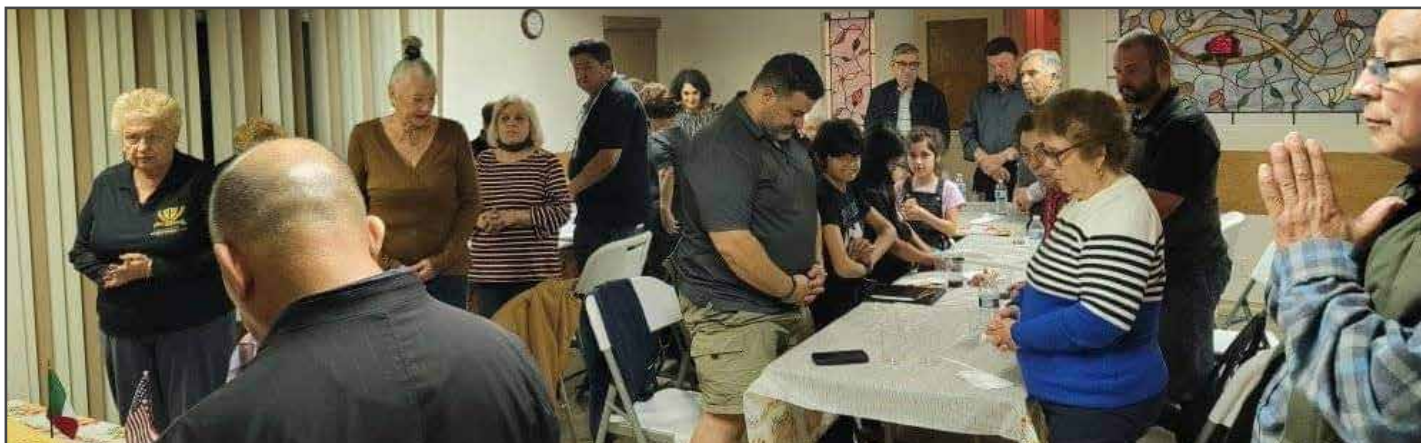
Br. 111, November 2021 Meeting

HOPE the Light that SHINES in the darkness ∞