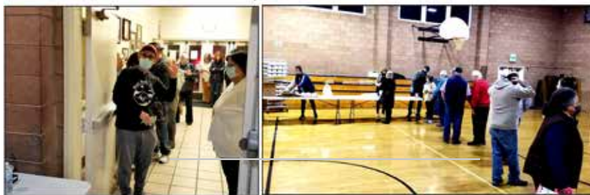
Members lined up at the door