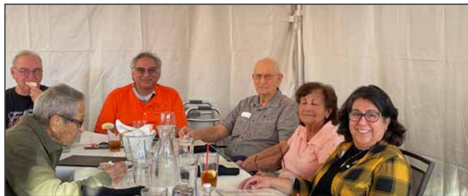
Br. 445 Luncheon at Palermo's