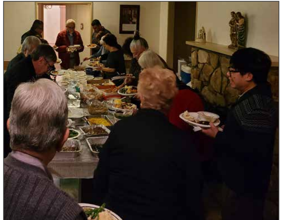
Br. 111, 2021 Thanksgiving Dinners