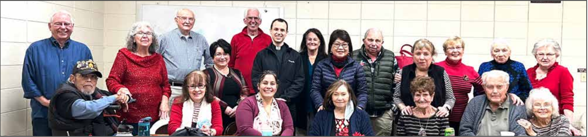
ICF Branch 250, Clovis enjoying a Christmas get together

Deadline for February Issue is January 10th. Send articles and photos: editor@icf.org