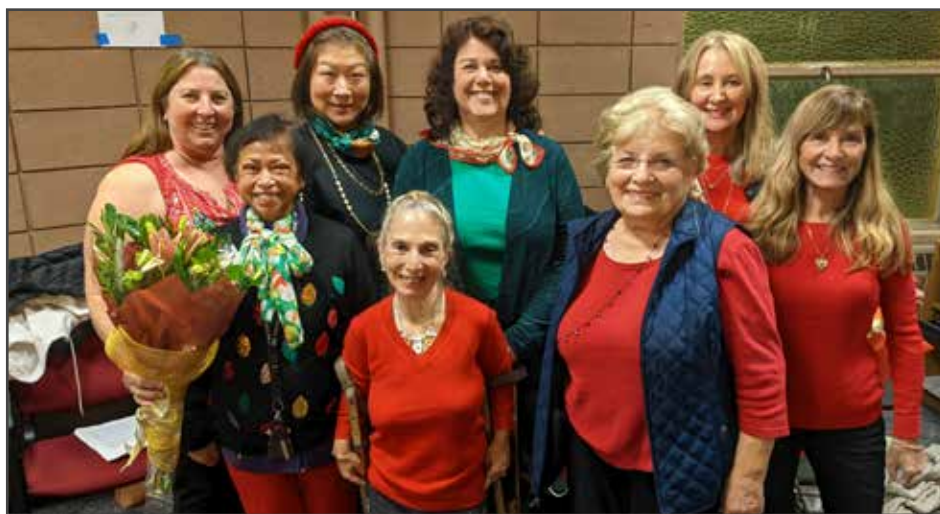
Br. 408 ladies