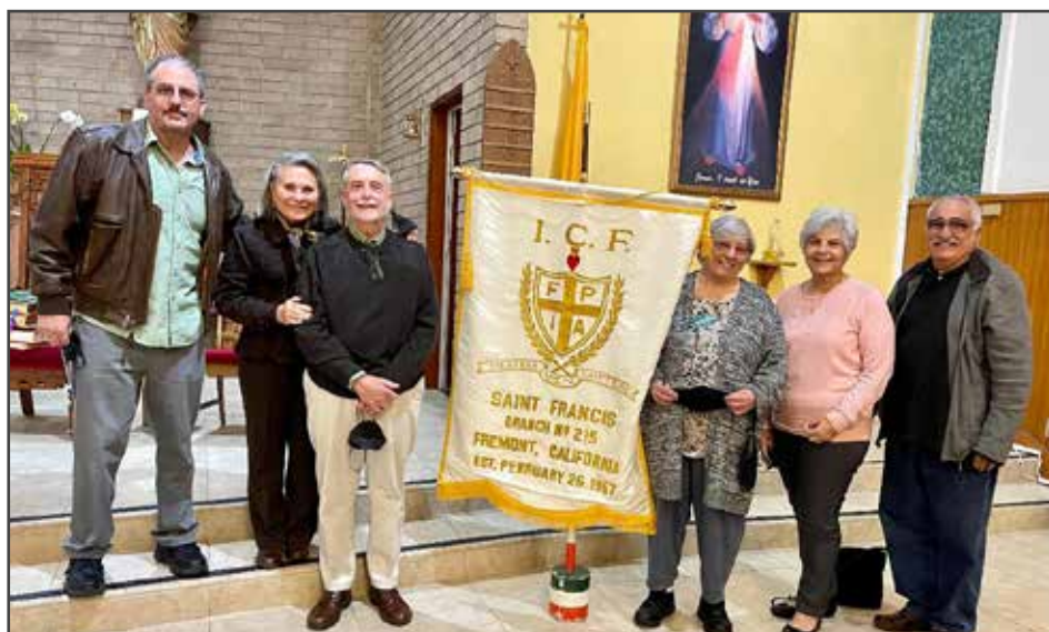
Branch 215 officers at Corpus Christi Church honoring past members

Our calendar sales are selling exceedingly well. Many members are buying for their friends and relatives.