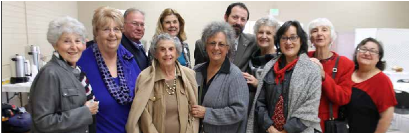
Br. 21 - GROUP SHOT - 2015