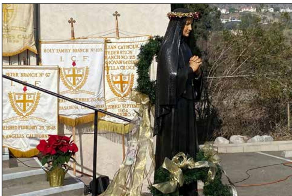
San Pedro Branch 115 attended the Annual St. Frances Xavier Cabrini Pilgrimage in Burbank on December 5, 2021.