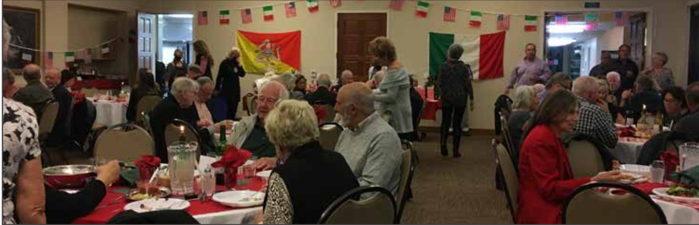
Br. 352, Dancing the Night Away