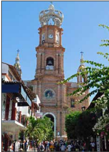
Our Lady of Guadalupe located in downtown Puerto Vallarta