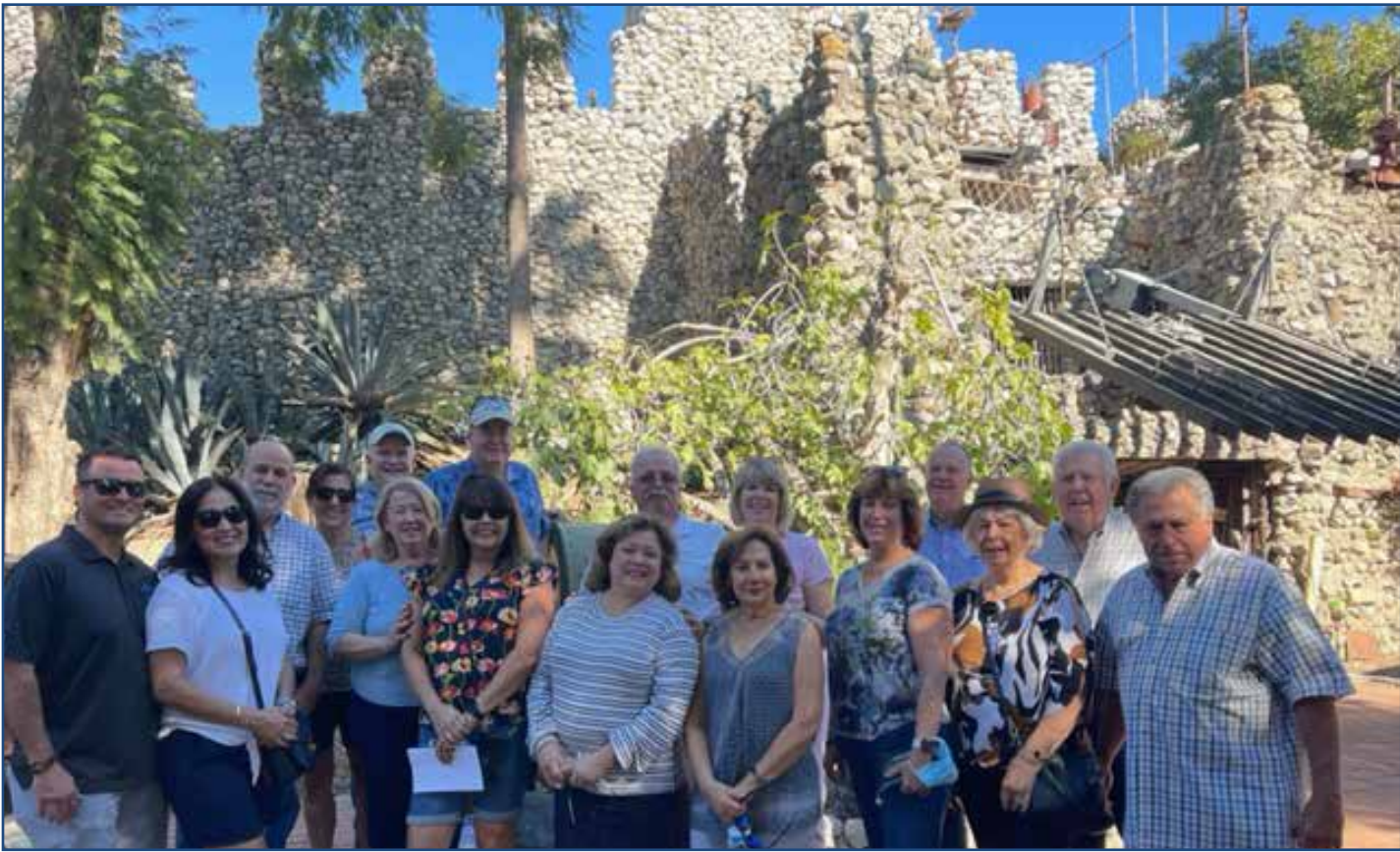
Branch 179 Members & Guests at Rubel Castle