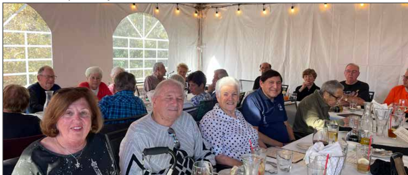
Br. 445 Members & Fellowship