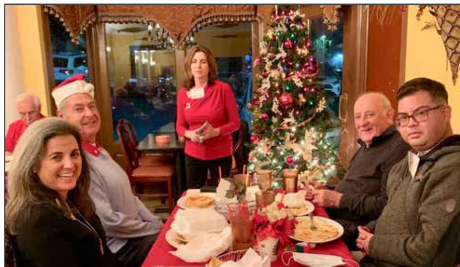
Br. 446 Our members enjoying dinner at Guiseppe's Restaurant.