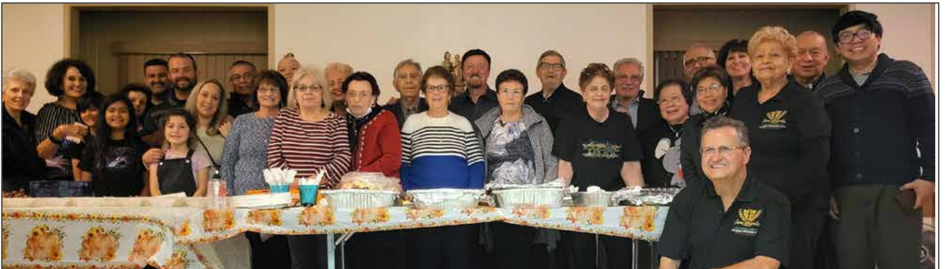
Branch 111 - November 2021 meeting & Thanksgiving Dinner

HOPE the Light that SHINES in the darkness ∞