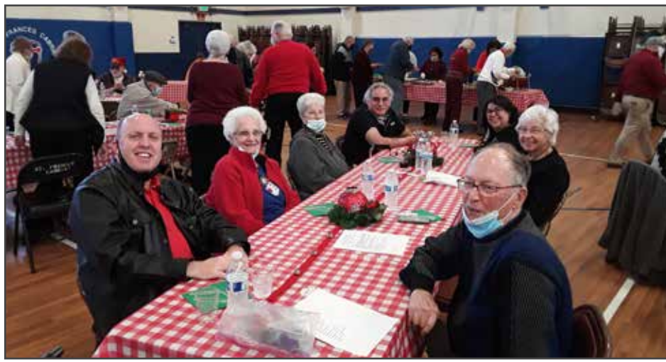
Branch 191 members at SCVD Christmas Party