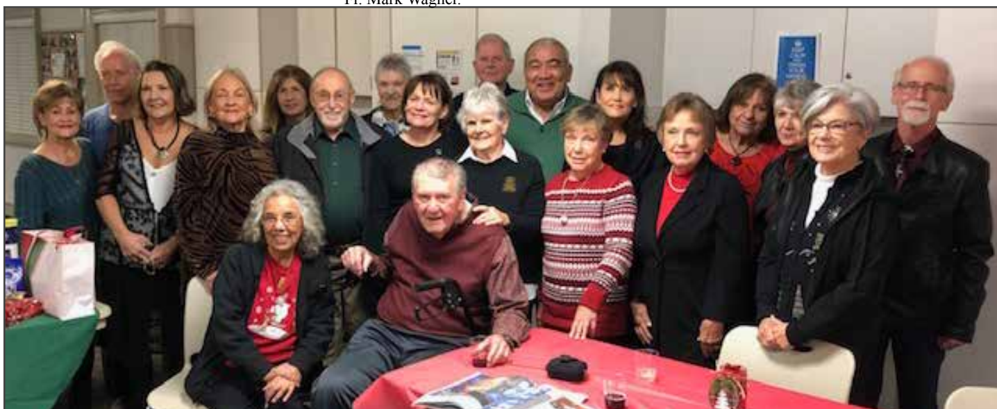
Happy New Year e Buon Anno from Branch 395