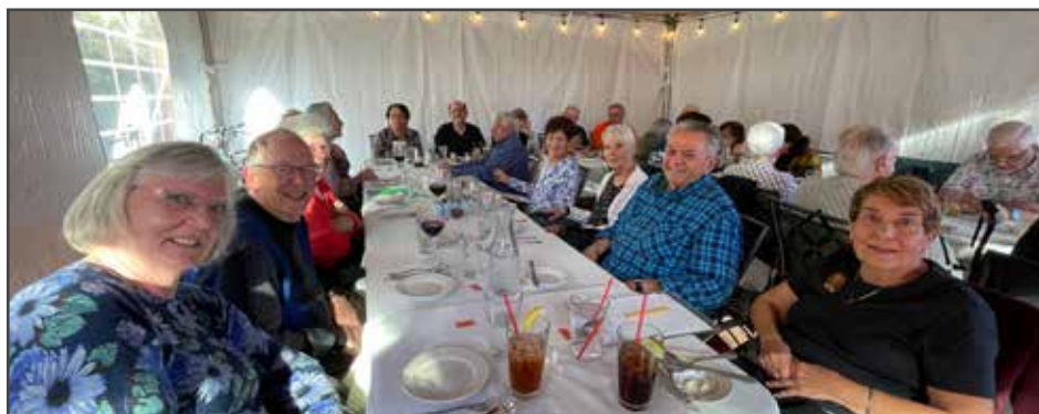
Br. 445 Second 2021 in person meeting