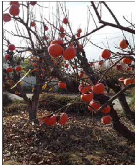
Branch 191 Persimmons at Andy's Orchard Morgan Hill