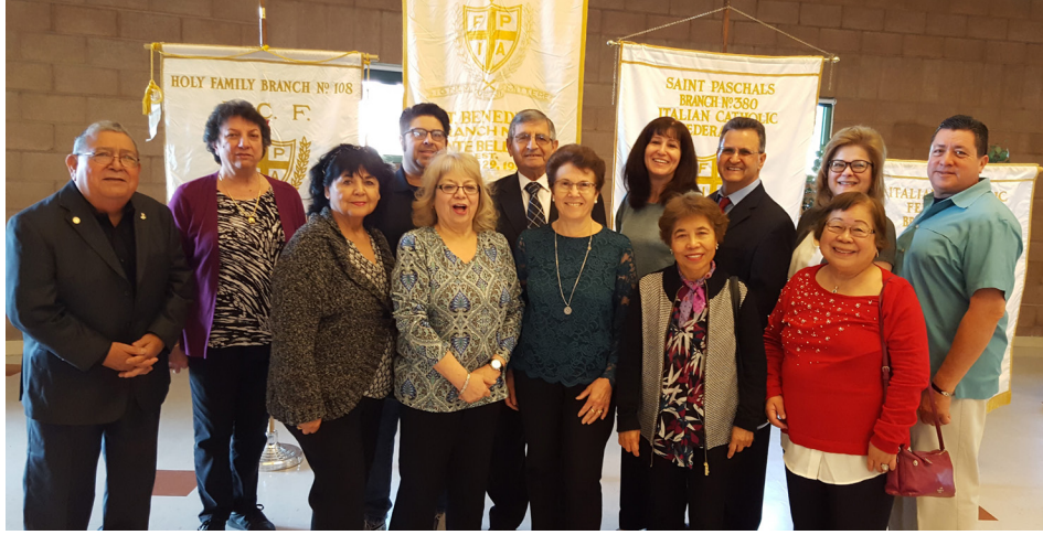
Members of Branch 111 at the 2018 Officer's Installation