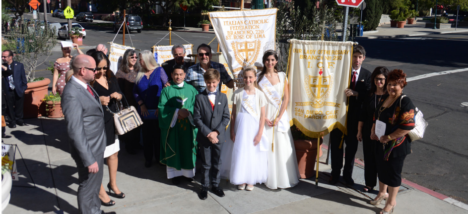
Members of Branch 230 at the recent District installation.