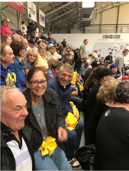
Branch 227, Capitola outing with Branch 21, Santa Cruz Warriors basketball game.

Our November Pasta Dinner was very successful, 432 meals served and we made $1224.00 selling 120 quarts of extra sauce with meatballs. The proceeds were donated to the Saint Rose Catholic School to offset the cost of their textbooks.