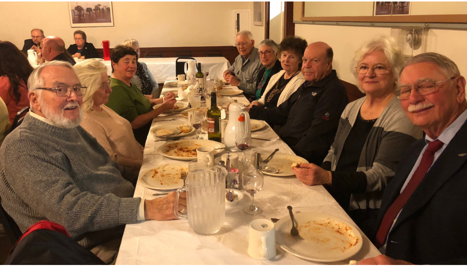
Happy Branch 285 members at the Installation.

The next event for our social calendar is our Anniversary Dinner on Saturday evening, May 17. We will celebrate our 92 years as an ICF branch. Details will follow in the April Bollettino.