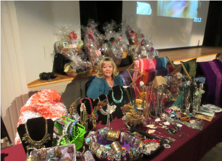
Members and vendor's at Branch 108's 2018 "Carnevale" themed Wine Tasting Event on February 10.

as part of the eight Italian Societies located there so that ICF and the other Societies can continue to support Saint Peters Church, their respective organizations and their Italian heritage through the celebration of new and traditional cultural events together in Casa Italiana (parish hall) and Saint Peters Church. Suggestions included reaching out to members of all ICF Branches and asking for their support by becoming corresponding members of Branch 67. Some even suggested asking each branch to become a corresponding member to help maintain Branch 67, our ICF charities and Scholarships and continuing our presence and support of Saint Peters Church. We would like to hear from you and your ideas on how we can make Branch 67 inclusive of local members and members from other States.