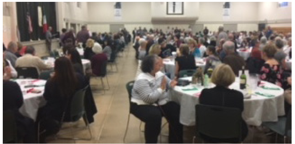
Let's eat! Members, families and friends enjoyed the Branch 395 polenta dinner.