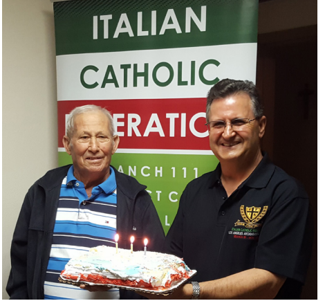
January Birthdays at Branch 111.