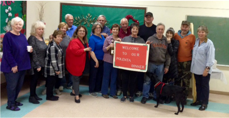
(Above) Members from Branch 14 who helped set up for our successful Polenta Dinner Thanks for all your support.

In April we will be celebrating our 39th anniversary as a branch here at Our Lady of Grace, so dust off those dancing shoes and get