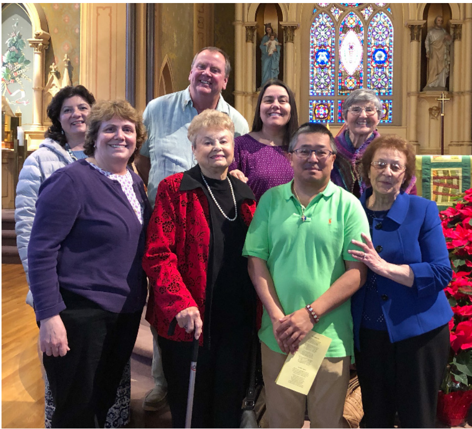
Members of Castroville Branch 51 at the Central Coast District Installation Mass.

There is a 10:00 a.m. parish mass for those who would like to attend mass before the meeting. The meeting will begin at 11:30 a.m. and a wonderful pasta and chicken lunch will follow. The cost is $10.00 per person. All are welcome to attend. Please RSVP by March 16 th to 831-633-5012 or email me at clstefani@aol.com . Hope to see many of you there.