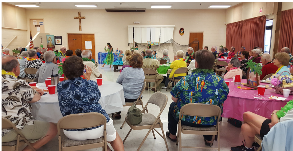
In January Branch 425 enjoyed a fun Hawaiian luau themed dinner with hula dancers!