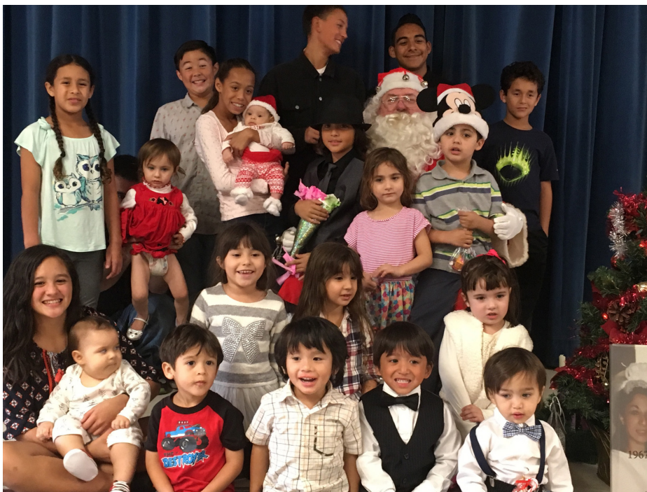
(Top) Branch 237 Gardena at Christmas, the under 13 crowd!