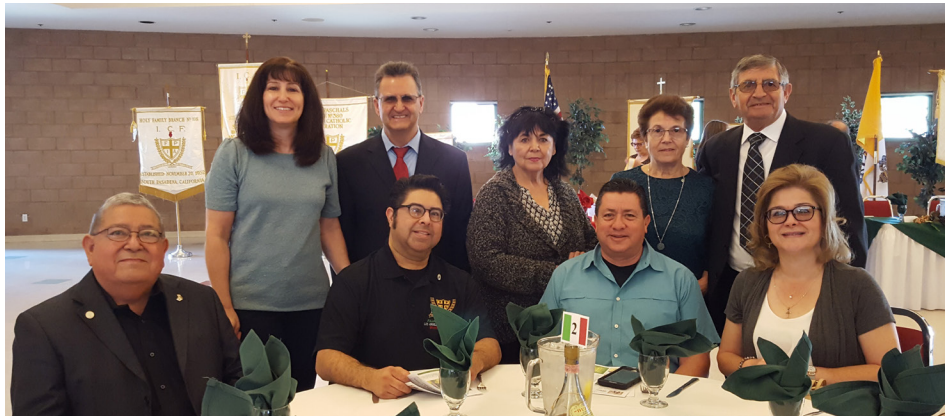
Members of Branch 111 at the Officer's Installation.