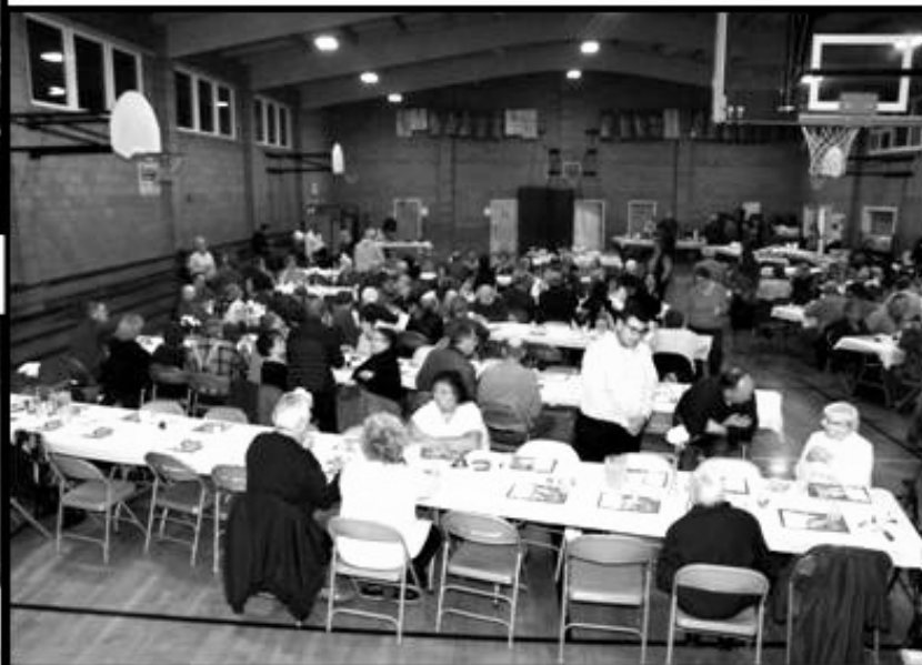
The Hall is getting fuller