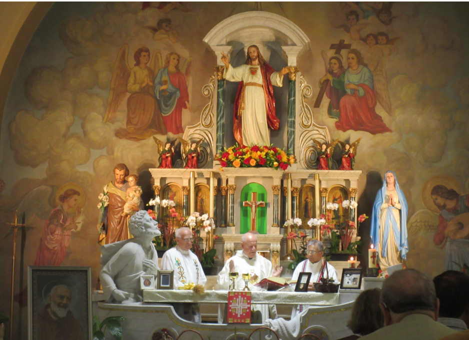
Mass at St. Peter's in Los Angeles.

follow across the walkway to the Parish Hall. Bring photos of your deceased loved ones.