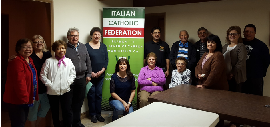
Members of Branch 111 at the January Meeting