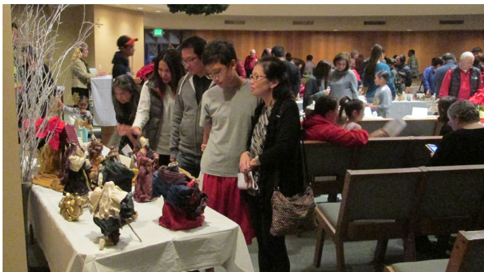
(Above) Great Turnout at the Branch 285 holiday party.