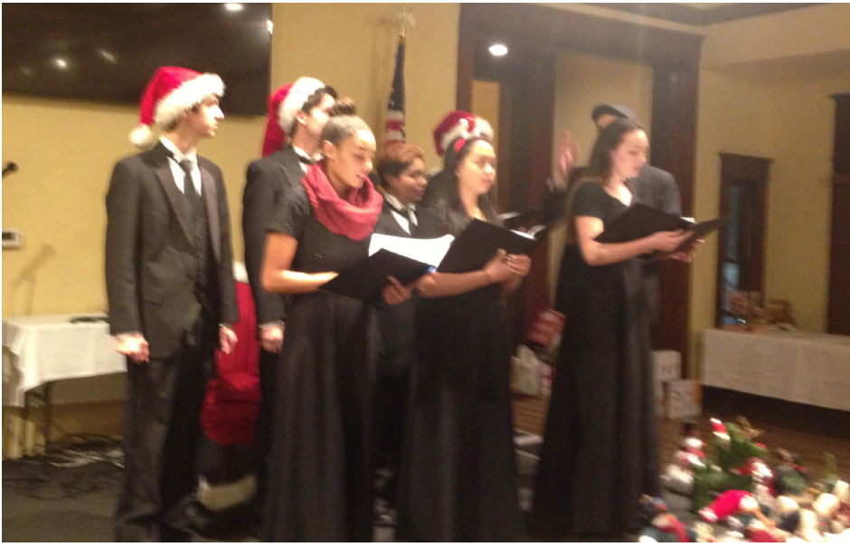
Branch 28 – Gilroy High School Ensemble Choir performing at the December Christmas Party.