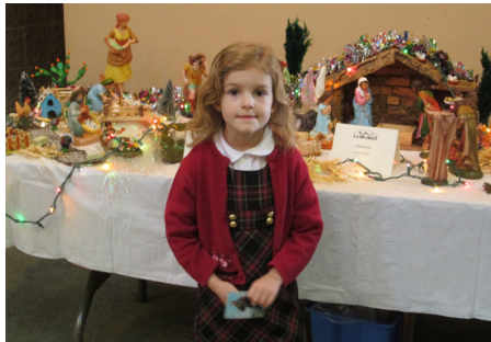
(Left) This cute face is why we do it all.