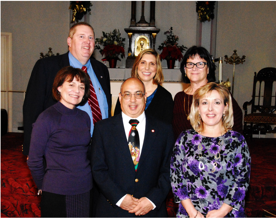
Installation of a young group of branch presidents at the Stockton District Installation.

Remember to be nice to someone you will always get it back in return.