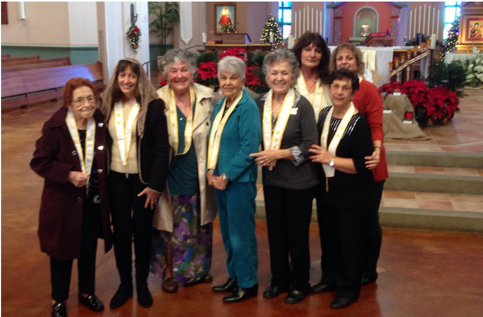
Newly installed officers of Branch 342's board.