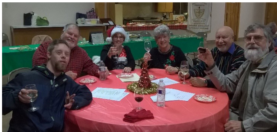
Celebrating the holidays at Branch 75, Cloverdale.