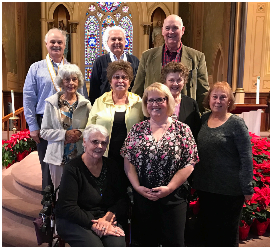
Installation of the Branch officers of Branch 229.