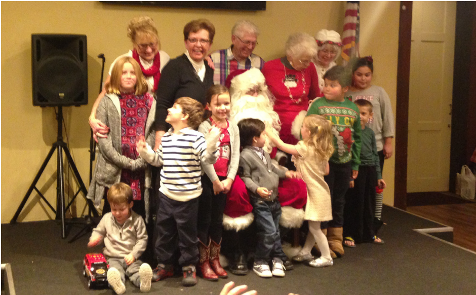
Santa Claus with children and members at the December Christmas Party.