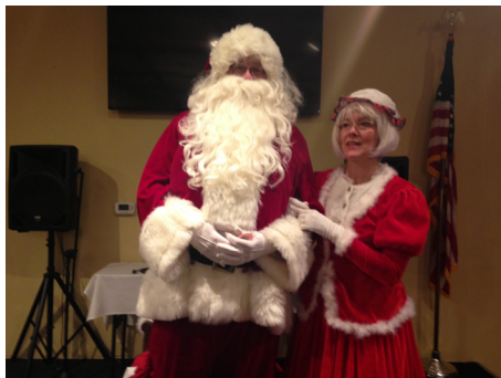
Branch 28 – Mr. and Mrs. Santa Claus at the December Christmas Party.

Branch 28's Christmas dinner meeting was held on December 18, 2017 at the Old City Hall Restaurant in Gilroy. The Christmas dinner meeting saw members, guests, and children enjoy a performance of the Gilroy High School ensemble choir, a wonderful