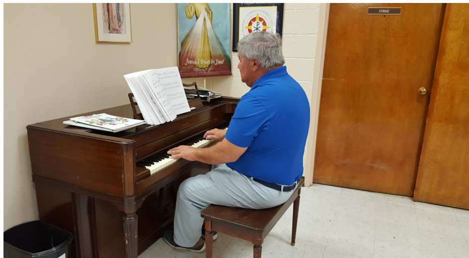
December potluck and Christmas celebration at Branch 425.