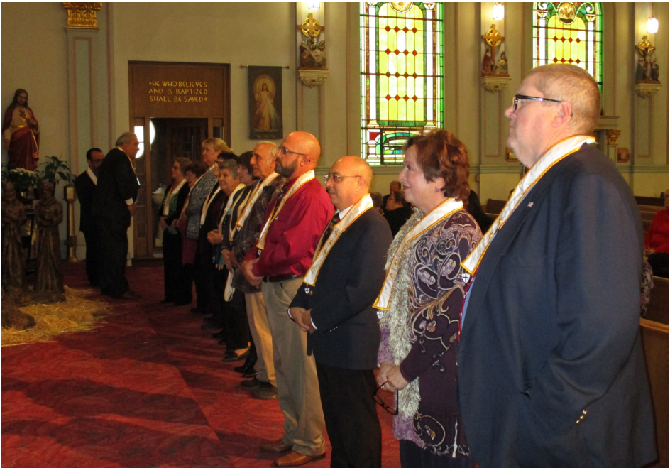
Installation of Stockton District Officers in January, 2018.

Our new president was bitten by the flu bug