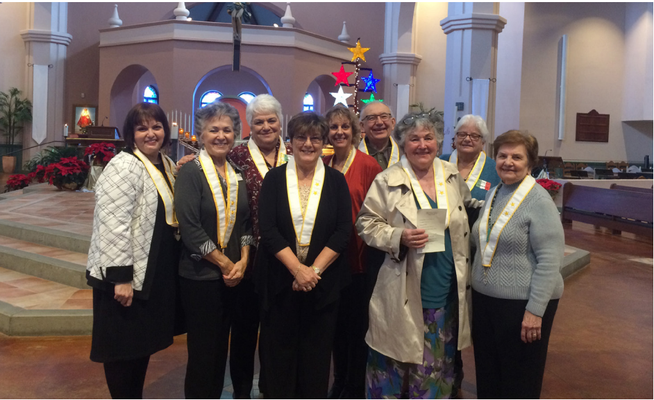
Newly installed officers of the Blessed Sacrament District Board.