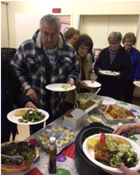
March 3 rd BR 327 St Charles Anniversary Dinner

February 18 th BR 403 St Dunstans 28 th Anniversary