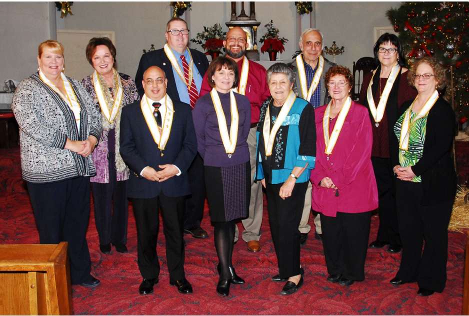
Installation of the Branch 390 officers.

delegates to the Grand Convention in San Diego, as well as for our donation to Gifts of Love and for an increase in the number of student scholarships.