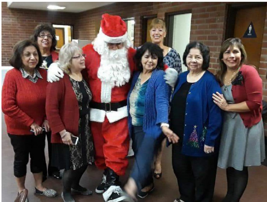
Branch 111 Christams Party.