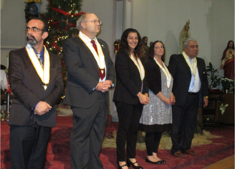
Central Council Members at the Stockton District Installation in January, 2018.