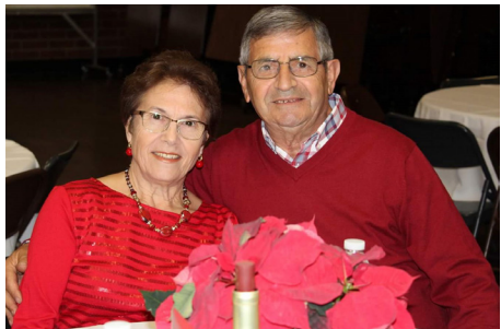
Branch 111 Christams Party.