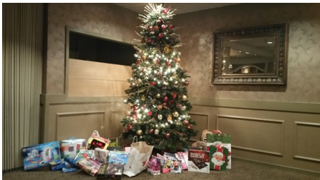
Toys and games donated by Branch 308 members 12-13-2017, for Valley Childrens Hospital patients"