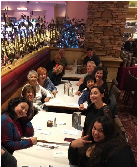
Merry Christmas from some Happy gamblers at Thunder Valley from Branch 14, Crockett.