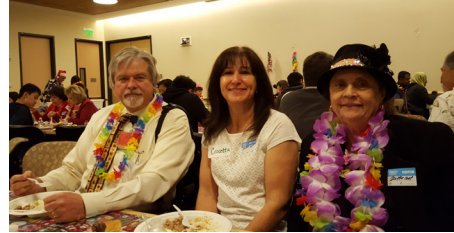
Members of Branch 111 attending the CHLA 2017 Christmas Party.