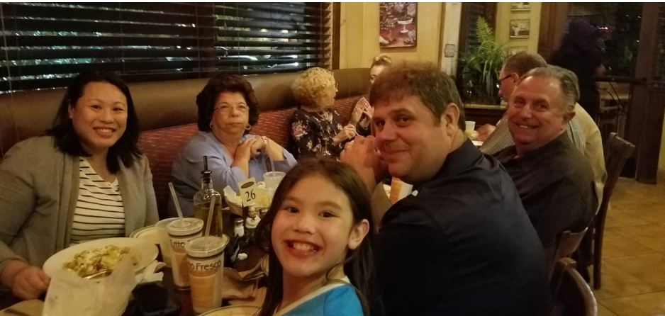
Irvine, Branch 423 celebrating a meal out together.