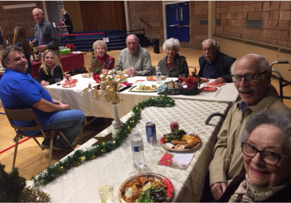
Members of Branch 408 celebrating a Christmas Potluck.