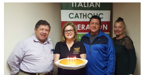
Branch 111's celebration of birthdays.