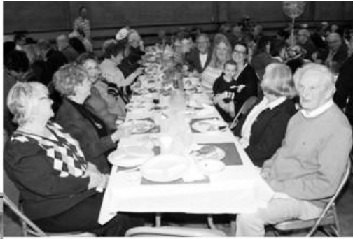
A baby always takes the spotlight