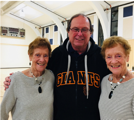
Branch 103 members celebrating.