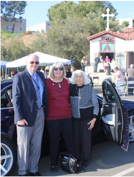
Members of Branch 108 attending the Saint Frances Xavier Cabrini Pilgrimage Mass and luncheon in Burbank.