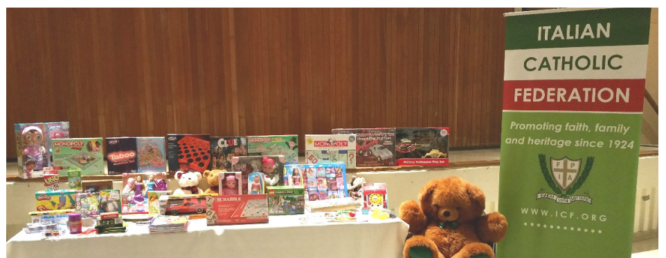
Branch 169's December Toy Drive.

Branch 169, Ventura, held a joint dinner potluck with the Sacred Heart senior group on November 16 th . We ended our toy drive in support of the First Annual Los Angeles Children's Hospital Holiday Party for Thalassemia. During our toy drive, more than 200 toys and gift certificates worth over $1,000.00 were donated. Branch 169 thanks its members, the Sacred Heart Ventura Thursday Morning Bible Study group and