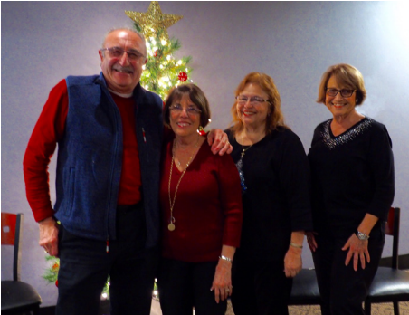
Members from Branch 54 and 14 having fun at the District Christmas Party.