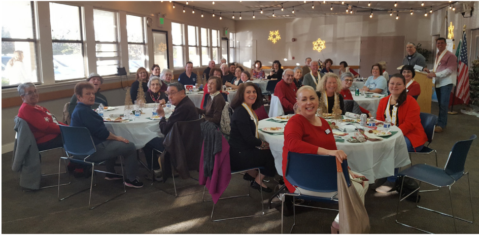
Branch 442, Christ the King, sharing Christmas cheer.