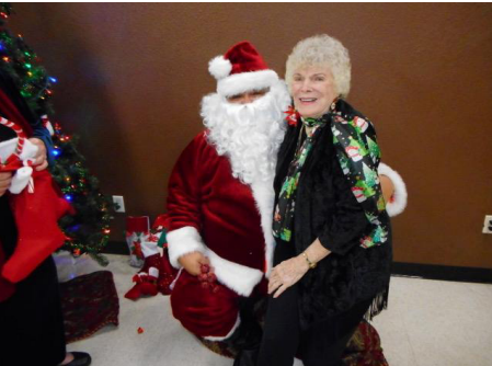
Members of Branch 342 had a great time visiting with Santa.

Please make sure to get your tickets to our annual Polenta Dinner which will be held at St. Teresa's Hall on Saturday, January 13th. Our great team of chefs will be preparing