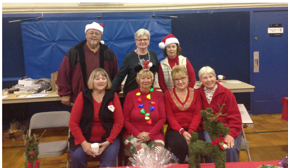
Branch 28 - Christmas Bake Sale crew getting ready to start selling the many incredible bake goods prepared by our members.

for one, and $81.60 for two. If you pay for a new member, please have them complete an ICF Application to join. This way they get the full benefits.