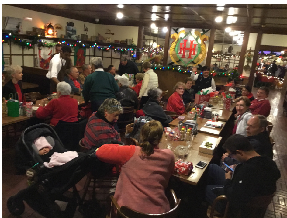
Visiting, eating, and waiting to open gifts at the Branch 184 Christmas Party.