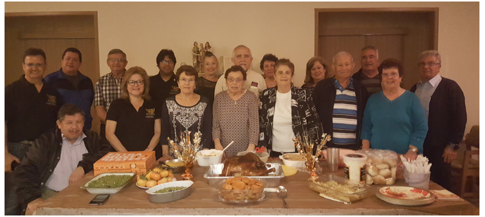
Branch 111 members at the November meeting and Thanksgiving Dinner.