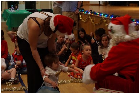
(Above) Santa greets children at Branch 380 Christmas party.