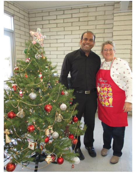
Celebrating Christmas and a Pancake Breakfast at Branch 413.