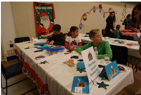
(Below) Kids enjoying craft tables at Branch 380 Christmas party.

We also welcome our 2018 Branch 380 officers elect. They are already working hard to plan some great meetings and events for the new year.