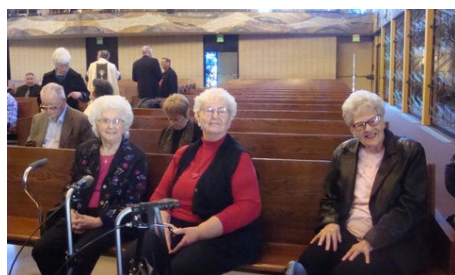
Branch 326 officers at the installation.