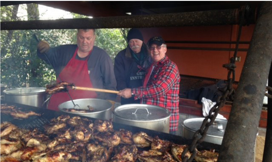
The Branch 75 BBQ chicken crew.

Thank you to our generous Blood Donors! The Bay Area has been facing a Critical late winter Blood shortage likely due the