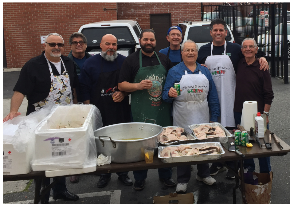
San Pedro Branch 115 celebrating the Feast of St. John Joseph of the Cross with a BBQ swordfish Dinner-Dance on March 4, 2017.