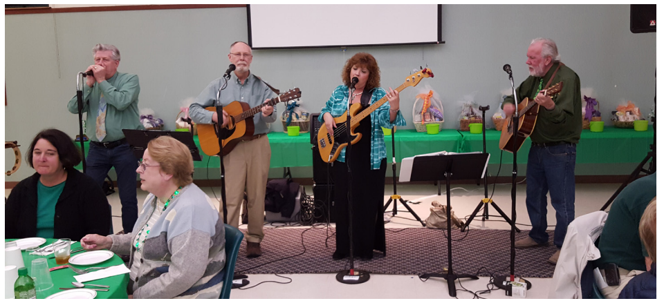
Branch 327's St. Patrick's Day band.