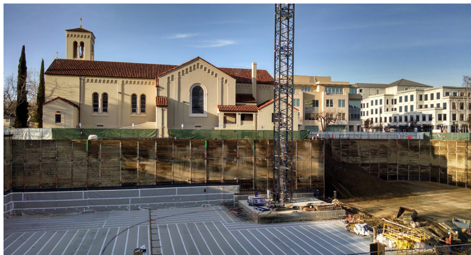
Contruction at St. Joseph Church, Mountain View, home of Branch 47.

June 7- Fundraiser - Barbequed Rib Dinner This is a great dinner, Ribs, Beans, Salad and Dessert. Wine is included. Let’s make this a huge success and help the Branch keep going! $30 Adults $15 Children 12