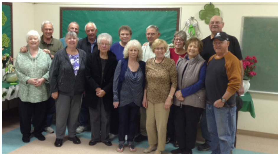
Happy St. Patrick's Day. Crockett Br. 14 little leprechauns who helped set up for our dinner.

be beyond amazing. Thanks to all who worked hard to make all of the above appear effortless.