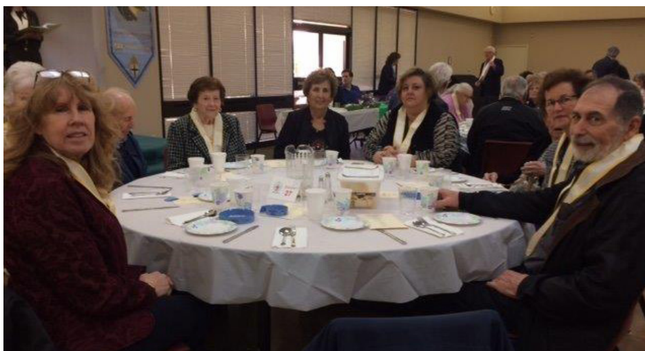
(Below) Branch 27 officers and members enjoying lunch at Holy Spirit Church.