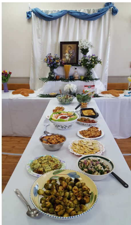
Branch 442 celebrated the feast of St. Joseph with a traditional altar and table.