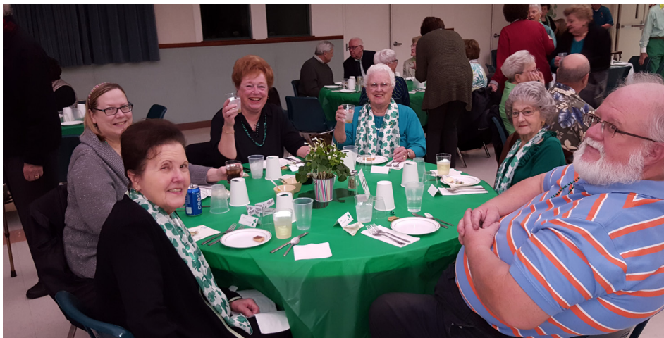
Guests having a good time at the Branch 327 St. Patrick's Day Dinner Dance.