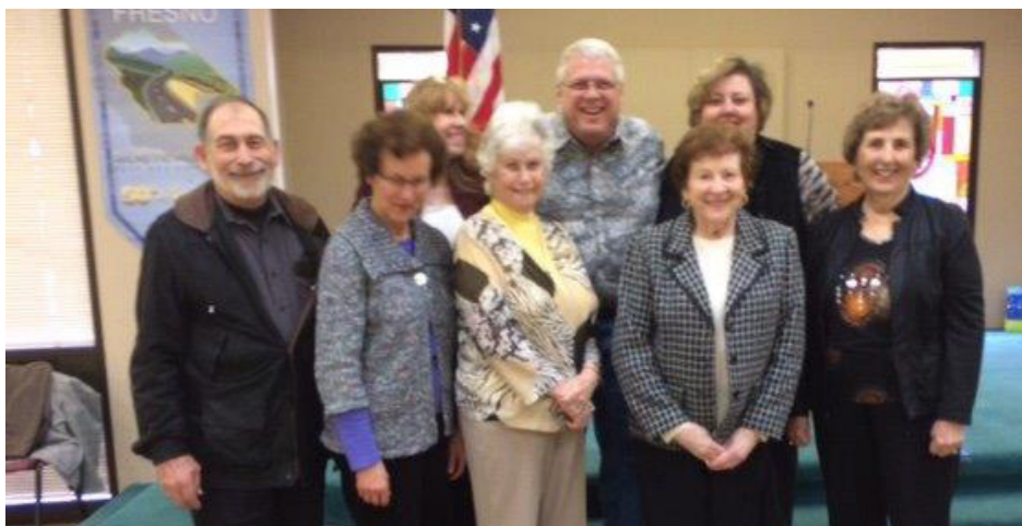
(Top) Branch 27 Officers at the Fresno District Installation.