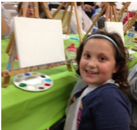
Enjoying Paint Nite Fun at Branch 138.