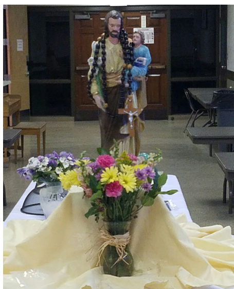
St. Joseph's Day at Branch 434.

Branch 434 will be preparing soup with bread for the Meager Meals church Lenten event which will be held on April 3, 2017.