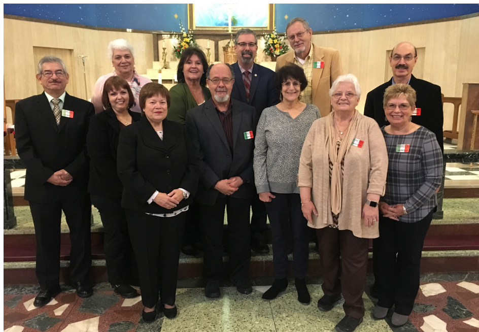
Branch 438 Officers at the District Installation.