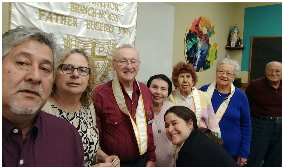
Enjoying a good meeting at Branch 433.

June 3 – Ports Baseball Game, Banner Island, 7 p.m.