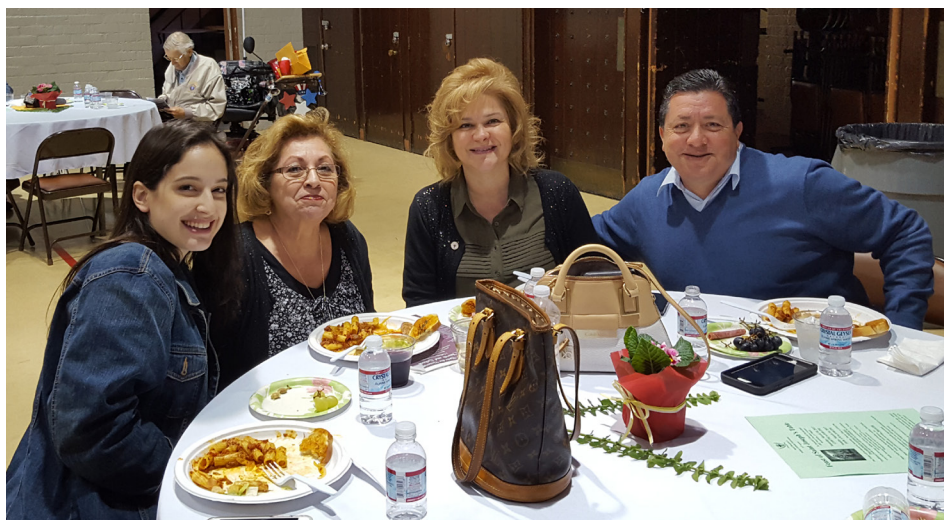
Members of Branch 111 attending the Los Angeles Archdiocese Installation of Officers.