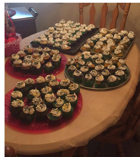
Members of Branch 362 enjoyed festive cupcakes at its Mardi Gras celebration.