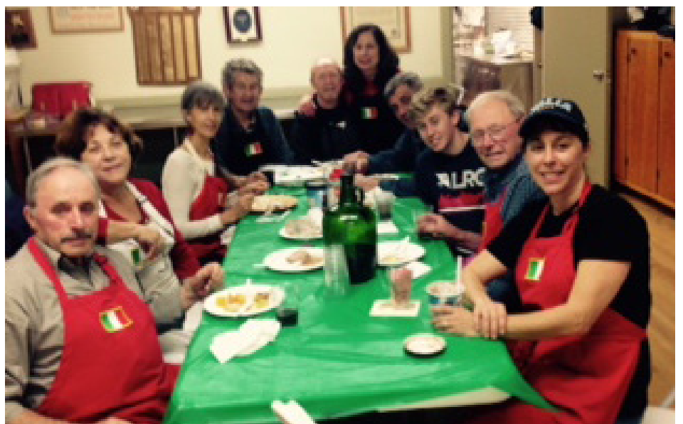
Enjoying another wonderfully prepared meeting dinner at Branch 332 in Novato.