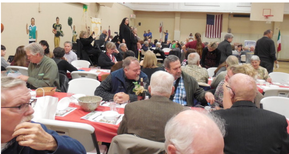
Branch 342's January Polenta Dinner.

At the February meeting, the members voted to give one $400.00 first year