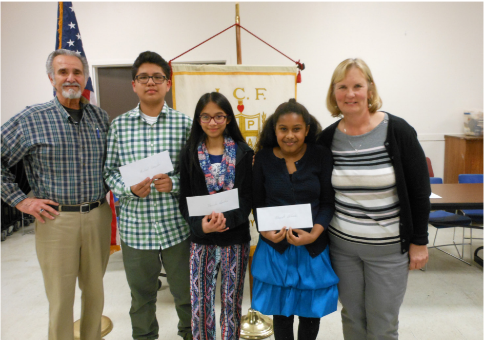
Branch198 President, School Scholarship winners, St. Eugene Teacher.