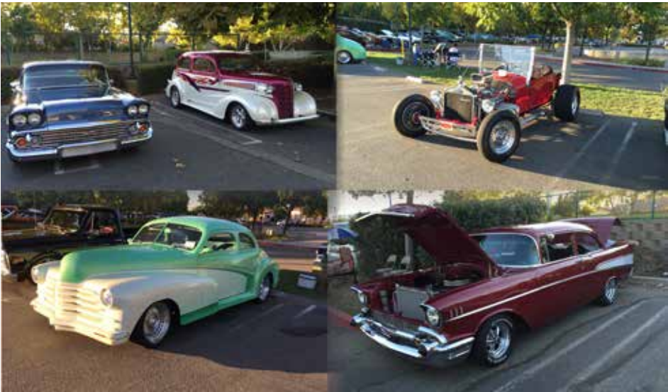
(Above) Branch 432’s show cars for the concourse. (Left) Branch 432’s Festa meal serving line, it’s all good.