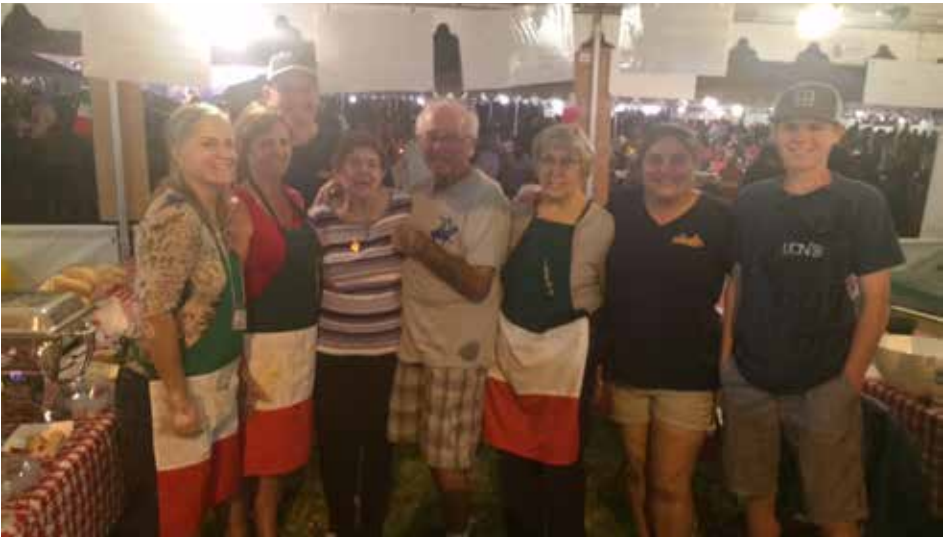
Members and friends work at the Italian Food Booth at the St. Bonaventure Fall Festival in Huntington Beach.

rigatoni during the three day event, making sandwiches and pasta bowls along with salad and breadsticks. Beautiful weather and wonderful music made for an enjoyable weekend. Thank you to all the members who contributed to the success!