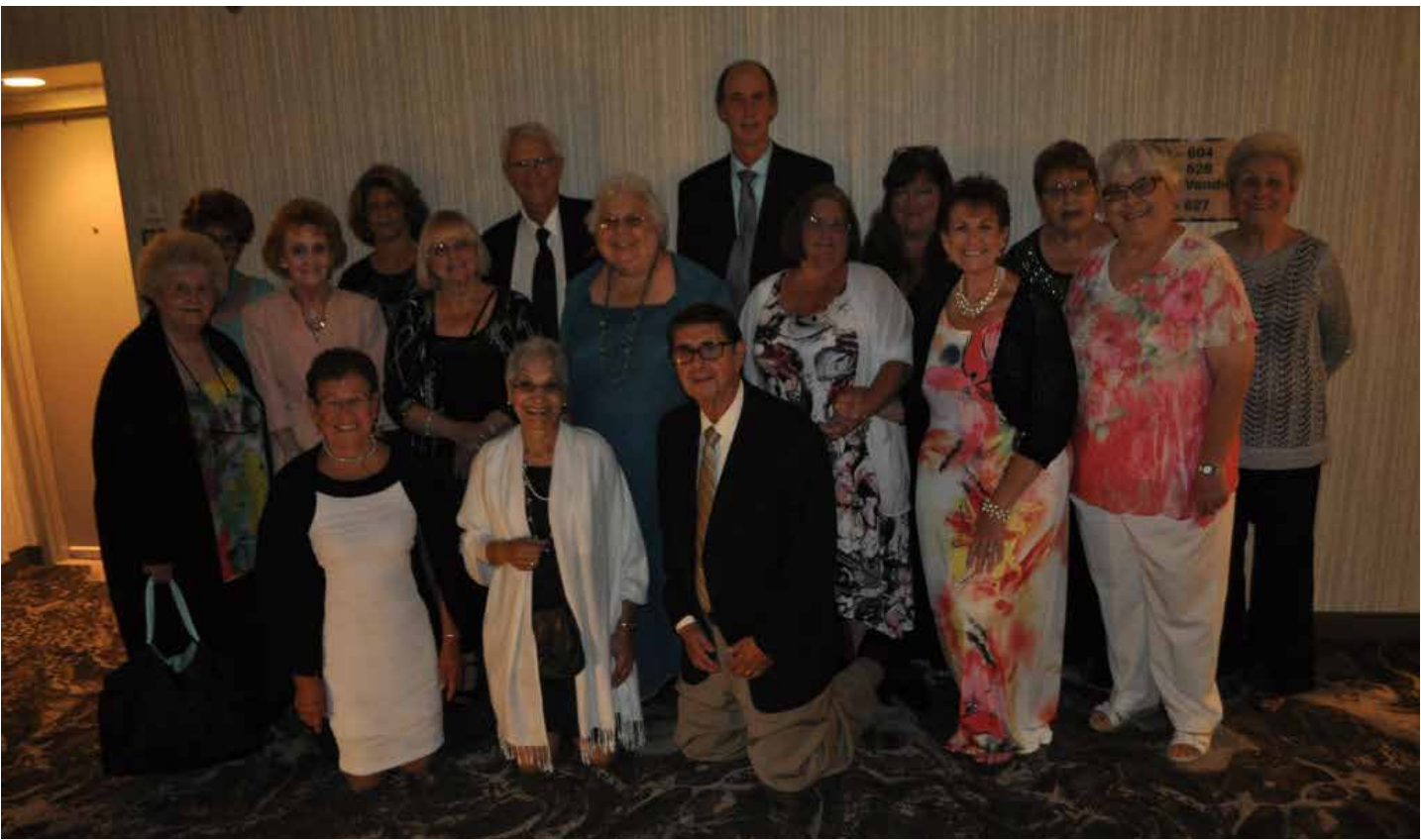
Members of the San Mateo District.

Hello Everyone! During the month of September we sent two representatives to the convention. They both shared their experiences about convention at a dinner meeting late in September. We also had a Champagne Bingo. During the month of October we sponsored a booth for our Parish Festival "Feast of the Holy Angels". Confirmation candidates volunteered to help hand out prizes and encourage parishioners to come and play our wheel game. Fun was had by all. This month we had a Champagne Bingo and dinner meeting. We want to thank all who have participated in the above events the past two months. A lot of energy and hard work was done by everyone and now are enjoying their October Festa Italiana Reno trip – well