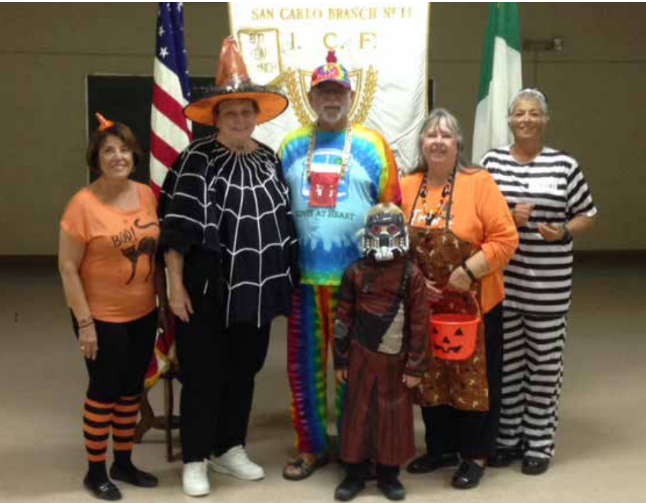
(Above) Happy Halloween from Branch 14 Crockett.