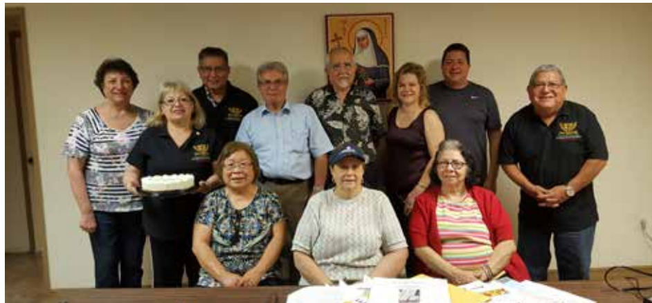
Branch 111 September meeting.