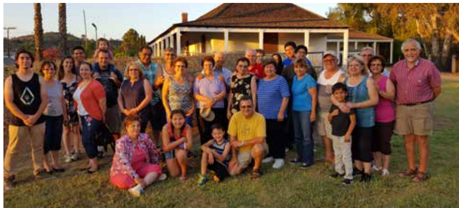
Branch 111 Picnic.