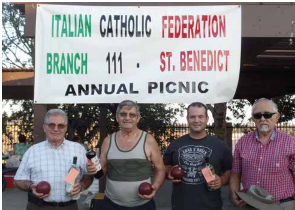
Branch 111 Picnic Bocce Winners.

Christmas tree for the Courthouse Museum's annual Holiday Open House.