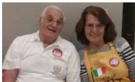
Branch 326 Pancake Breakfast.

2017 calendars have arrived and are for sale.