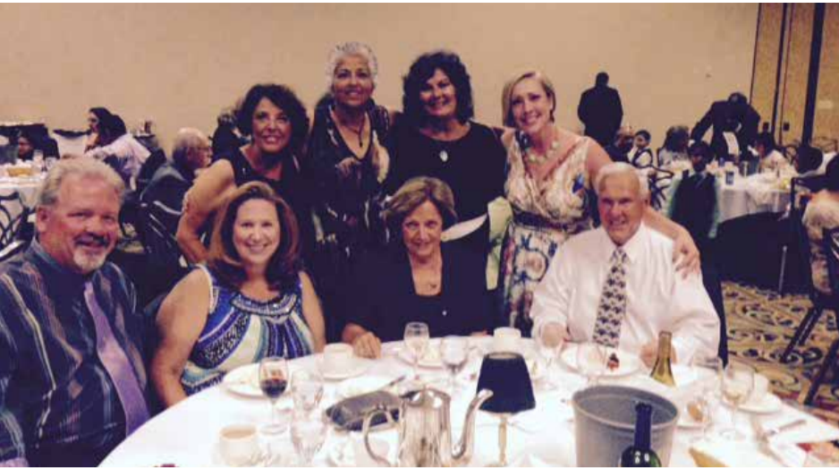
Branch 14 Crockett at the Convention in Las Vegas.