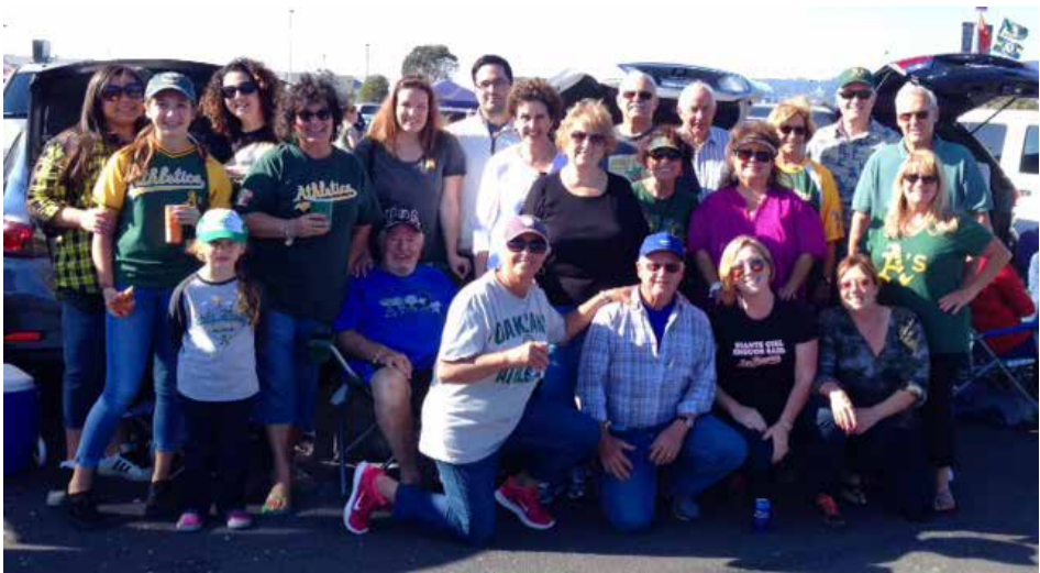
Members from Branch 14 Crockett Having fun at a tailgate party at a A's Ball game.

As hot as it was at our first post convention