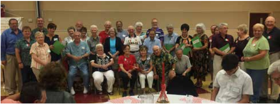
(Above) New members being initiated to Branch 438.