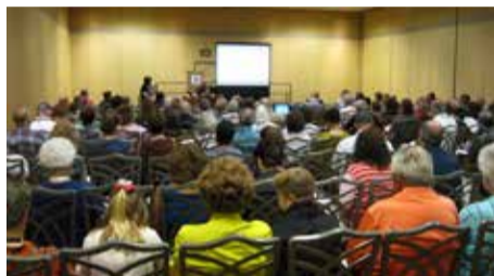
Members of Branch 108 enjoyed the Convention in Las Vegas.