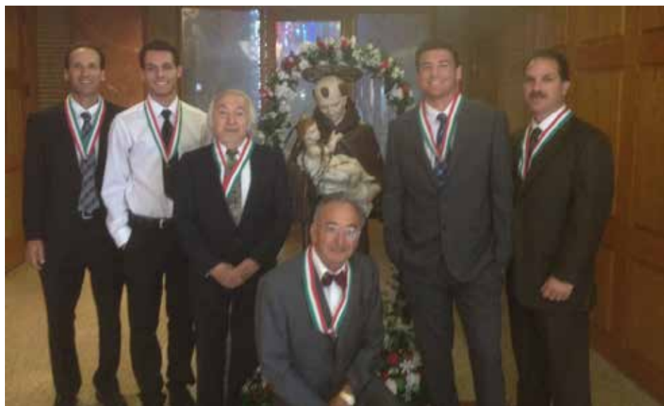
Branch 115 celebrated the Feast of Saint John Joseph of the Cross, patron saint of the island of Ischia, Italy with Mass, procession and Dinner-Dance on August 22, 2015.