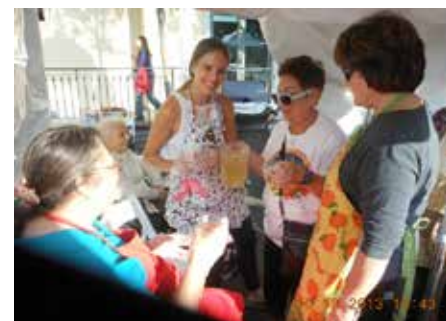
Members of Branch 108 manning the booth at the Holy Family Festival.