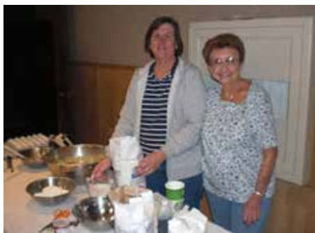
Members of Branch 261 making some yummy treats.