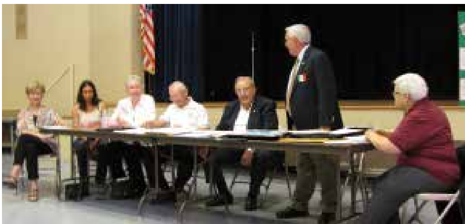
The Tucson District held its first district meeting. Congratulations!