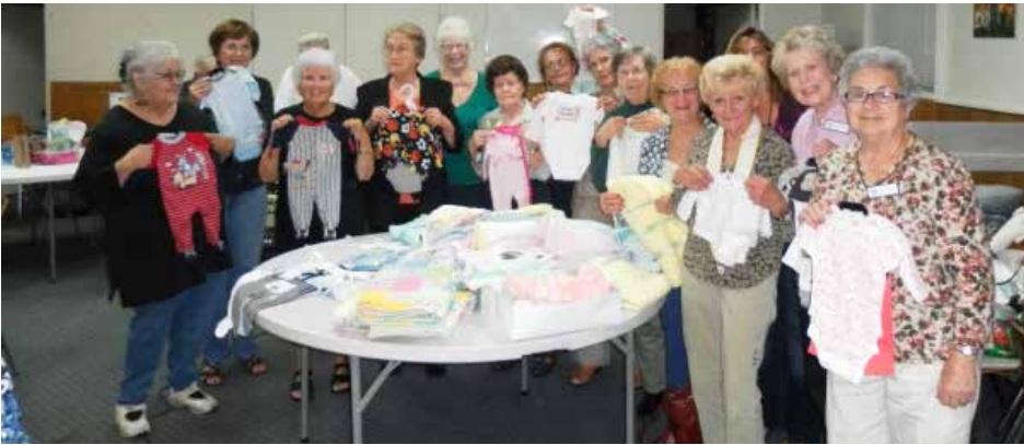
Branch 368 ladies with current Layette items on display.