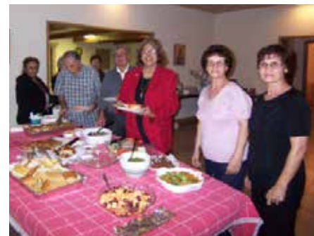
Branch 111 members at their Columbus Potluck dinner meeting.

November 08 – General Meeting/ Thanksgiving Dinner. Also will be Election night for 2014