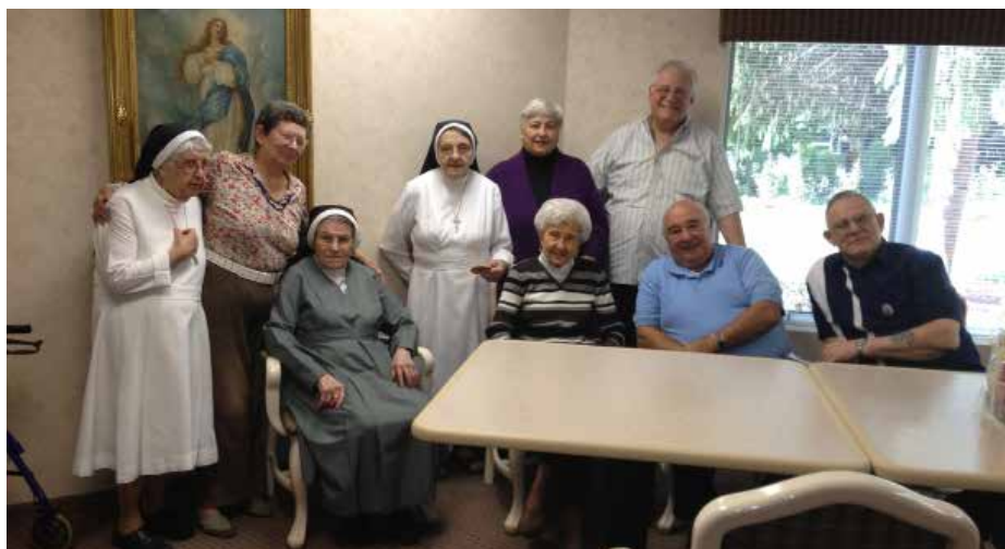
Members of Branch 358 visited the retired sisters of St. Charles Borromeo and had a wonderful time.