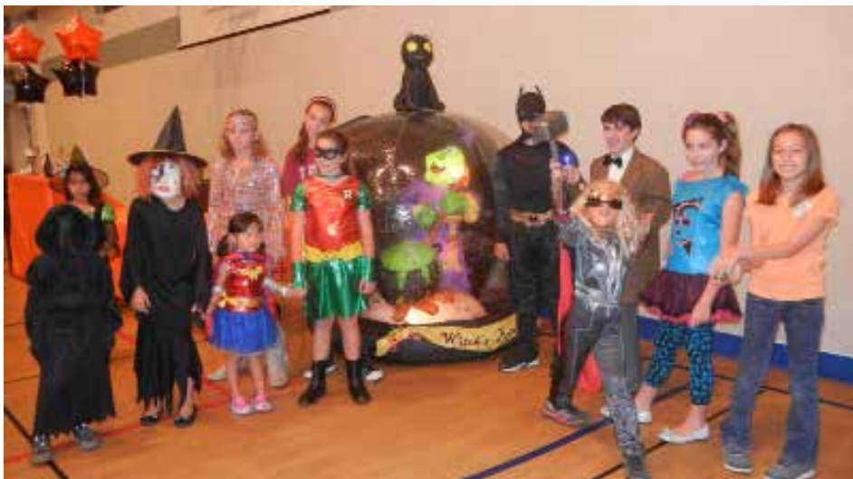
Branch 380 kids were "Dressed to Impress" for their Annual HalloWINE Meeting.

Branch 380's 2014 Officers, High School Officers, and Youth Officers.