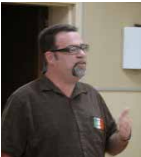
Branch 438's September Pizza night also highlighted members telling stories from their trips to Italy.