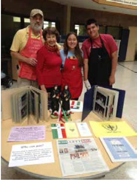
Members of Branch 408 had a Member-ship table at the Pancake Breakfast.

The November Thanksgiving dinner and meeting will be held November 4 in St. John's Hall. The cost of the dinner are canned