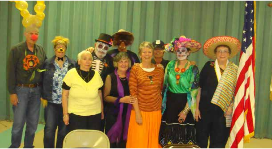
Members of Branch 14 enjoying Halloween together.

We have cancelled our Bingo & Pedro Tournaments due to lack of responses. Other fundraisers will be updated soon. In