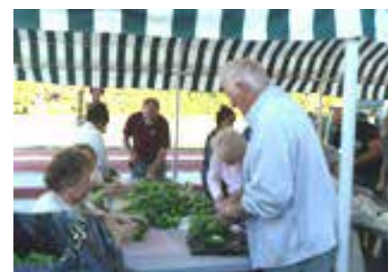
Members of Branch 191 slicing peppers for the St. Frances Cabrini Fiesta.

Feel the crisp change in the air, and soon, we will be "wasting away again in Margaritaville!" Plans for our annual polenta