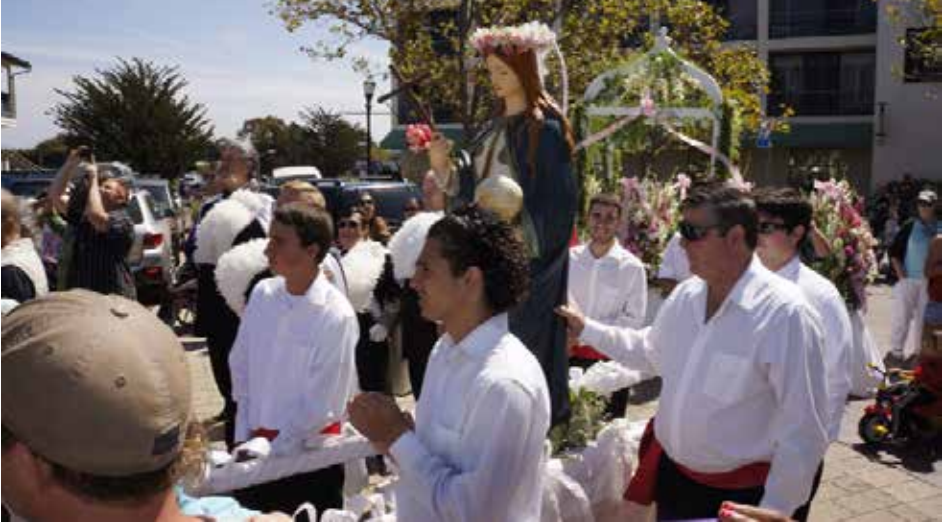
80th Annual Festa Italia Santa Rosalia Festival. There were Tarantella Dancers, and the youth carried the Santa Rosalia statue from the San Carlos Cathedral to the Custom House Plaza. Many people from all over came to enjoy this wonderful event!