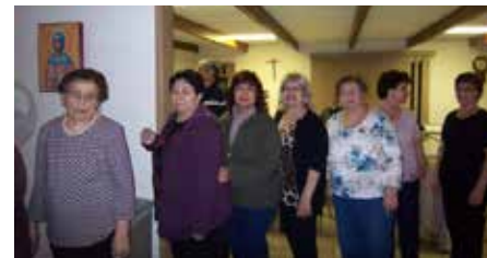
Branch 111 members in line at their Columbus Potluck dinner meeting.

November 10 – ICF Donut sale at St. Denis