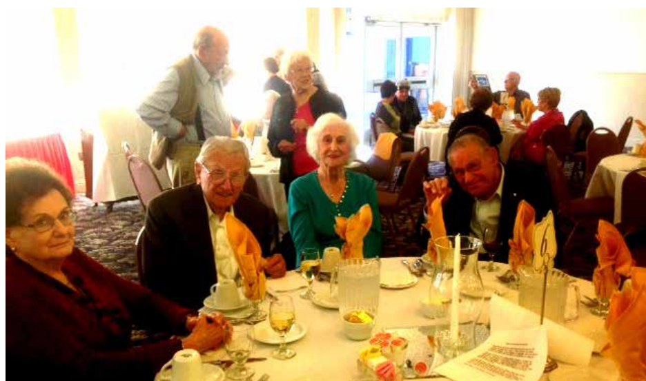
Members of Branch 163 at its recent dinner.