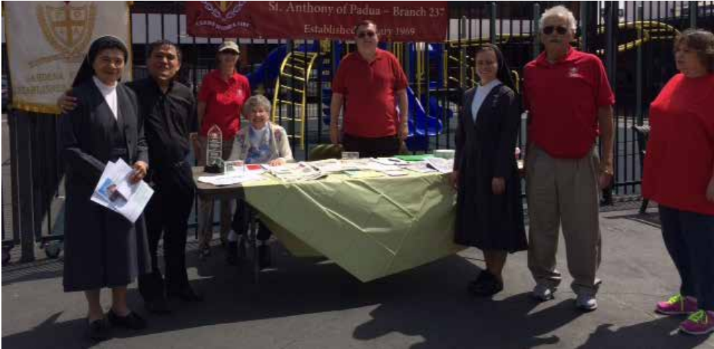
Members of Branch 237 hosted a coffee and donuts information booth.

Our June meeting will be held on June 18 th at 7:30pm. We will be discussing our annual Parish Fiesta which will be held on July 17 th -19 th . Please think about volunteering and helping our branch with our parish fiesta. There are many