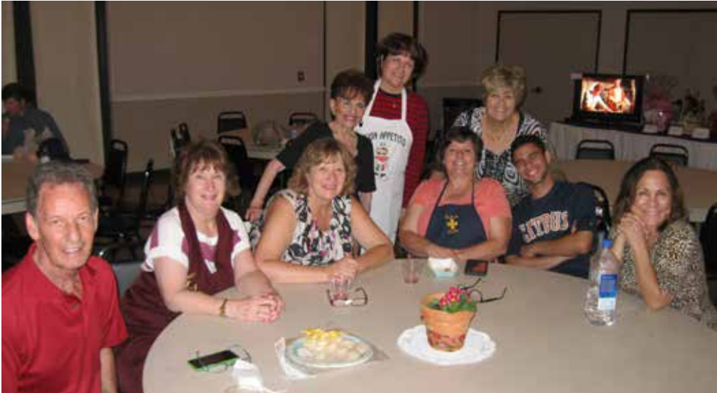
Celebrating St. Joseph's Day at Branch 108.

May 2, 2015 - LAADC Board Meeting at Holy Family Church, So Pasadena from 9:00 to 11:30 am hosted by Branch 108 May 30, 2015 - LAADC General Meeting at Saint Cornelius Church, Long Beach from 9:00 am to 11:30 am in the Parish Hall. District Meeting hosted by Branch 440. May 30, 2015 - Strategic Planning Workshop “Leadership Coaching” at Saint Cornelius Church, Long Beach from Noon to 1:00 pm (lunch) and from 1:00 pm to 3:00 pm (Workshop) in the Parish Hall. Workshop hosted by Central Council Strategic Planning Committee. All Branches of the District are requested to participate.