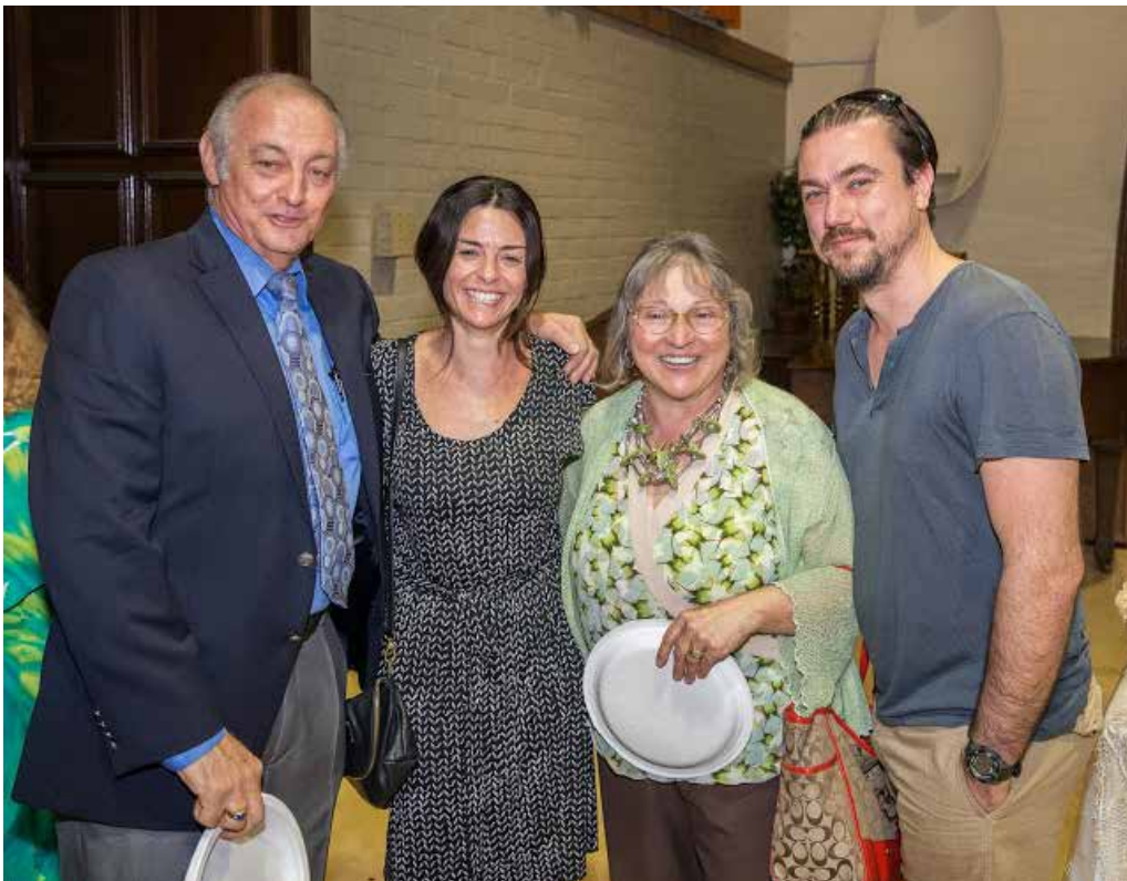
Members of the LA Archdiocese celebrated St. Joseph's Day.