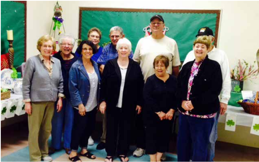
Members of Crockett, Branch 14 who helped set up and decorated for the Corned Beef Dinner.