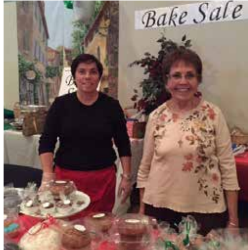
Branch 380 members celebrated their 29th Annual St. Joseph’s Day.