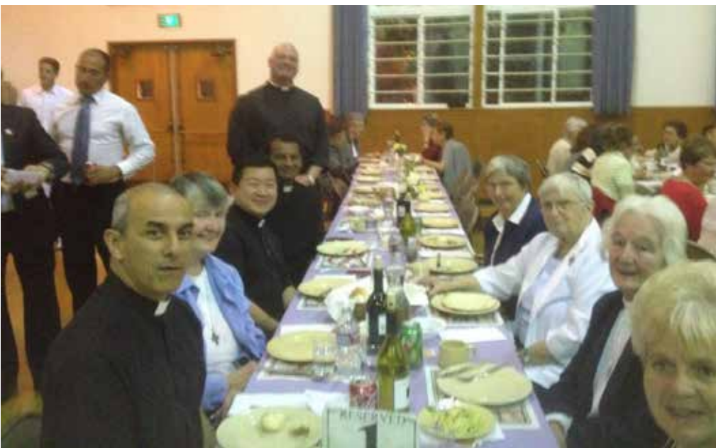
San Pedro, Branch 115 Crab Dinner-Dance on March 7 was a big success. Nearly 400 were served. Thanks to all the volunteers on the floor and the kitchen crew.