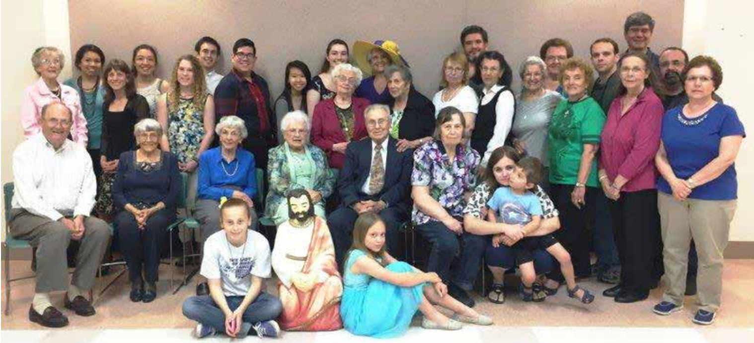
Members of Branch 39 at their St. Joseph's Day meal at St. Patrick's Parish.