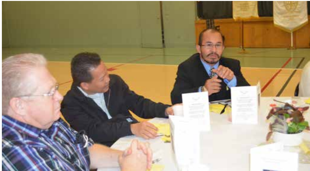
One Seminarian and Seminarian Administrator of the Stockton Diocese.