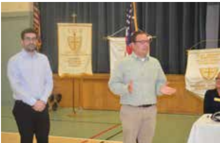
Seminarians thanking the ICF.