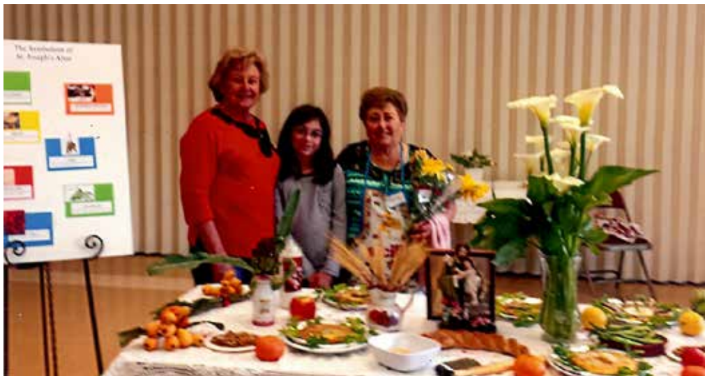
The St. Joseph's Table for Br. 435.