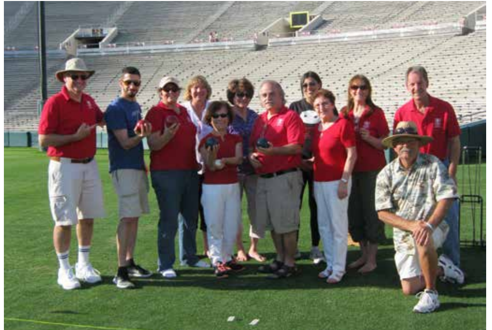
Members of the LA Archdiocese playing bocce at the Rose Bowl.