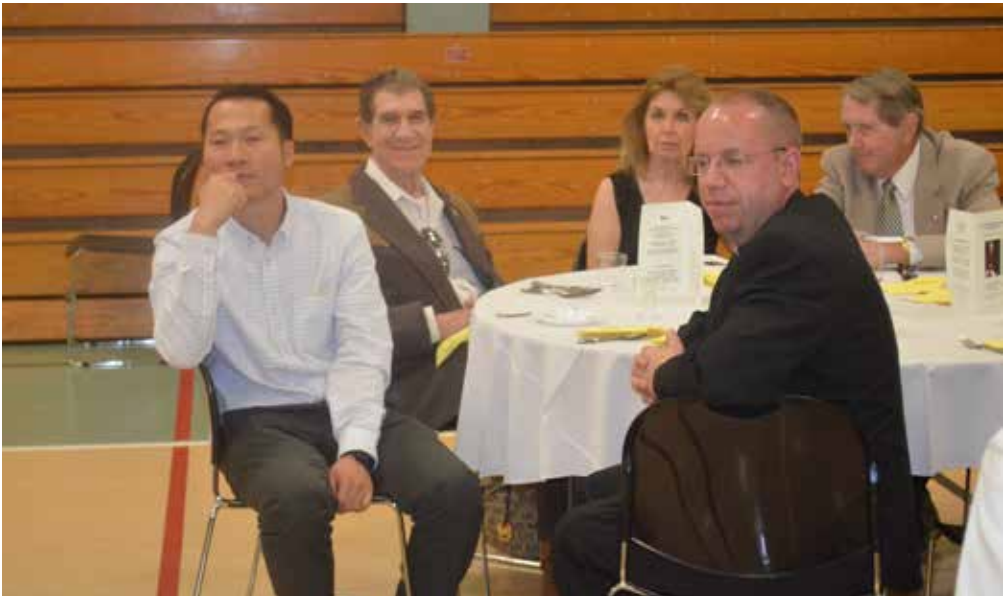
Two Seminarians attending the event.