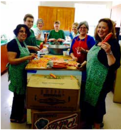
Special group of ladies peeling carrots for the Corned Beef Dinner at Crockett, Branch 14.