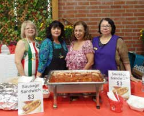
Montebello Branch 111 members working in the sausage section.