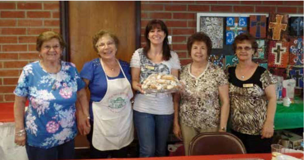
Montebello Branch 111 memebers working in the Cannoli Section.