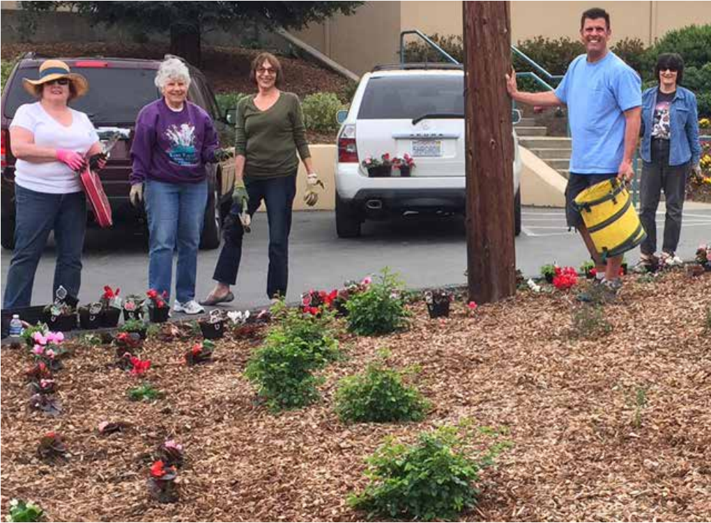
Members of Branch 442 planted a flower garden in front of the parish house.