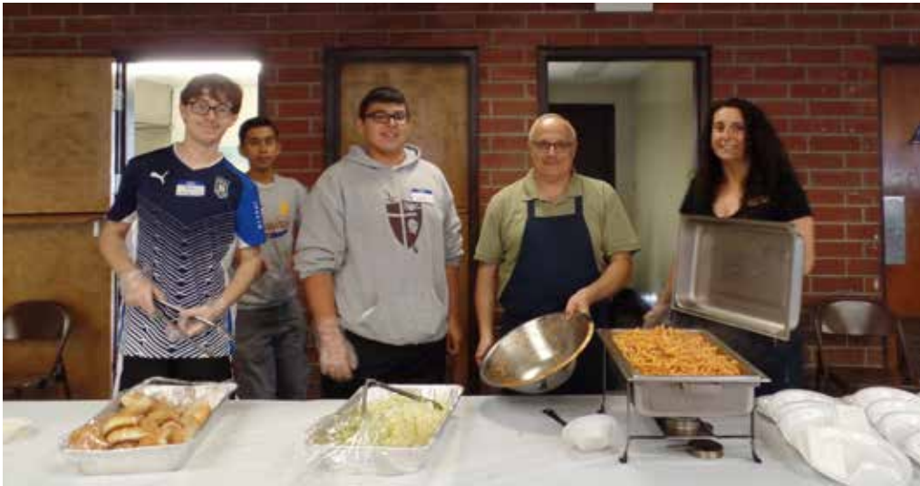
Montebello Branch 111 ICF members working in the free pasta section.