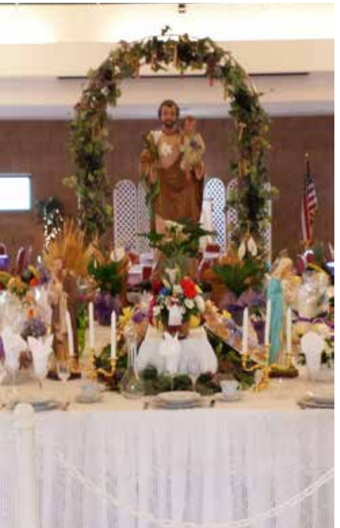
Downey, Branch 362's St. Joseph's Day Table.