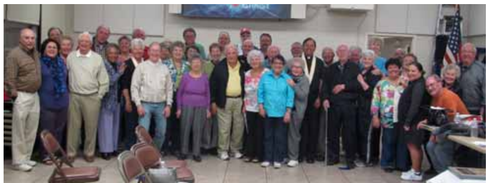
The Santa Clara Valley District April meeting. We have such great members!!!

678 Green Street, San Francisco, CA 94133 • (415) 362-6423