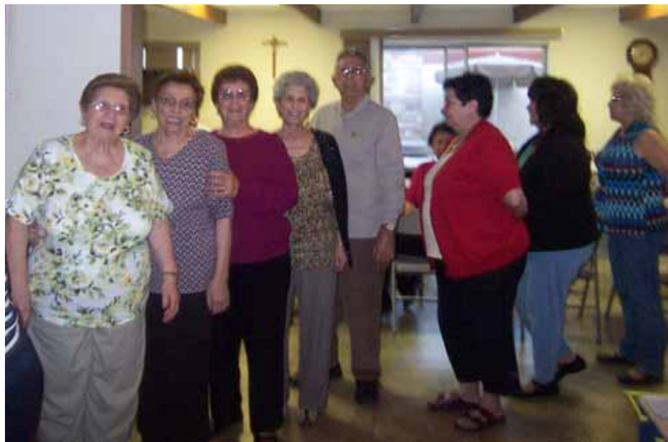
Branch 111 members at the April meeting.