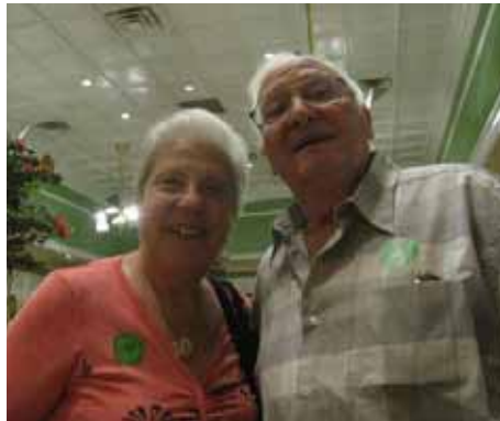
Branch 367 celebrated its 30 th anniversary in April.