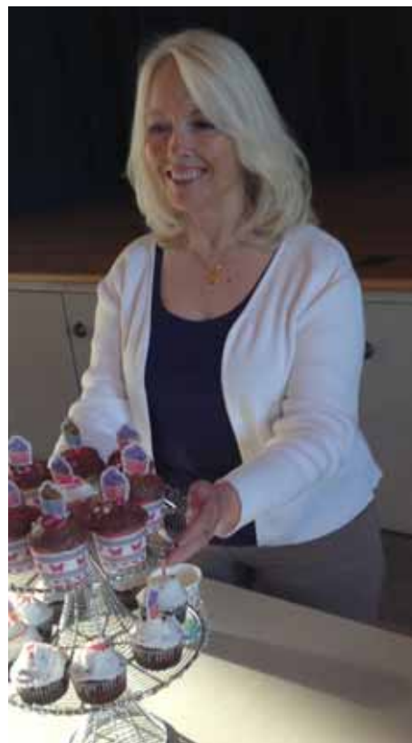
Members of Branch 108 enjoyed a Continental Breakfast on April 21.

- May 5, 2013 - ICF Br 108 Bocce (1 to 2:30 pm), lunch social and general meeting (3 to 5:00 pm). Mass at 5:30 pm.