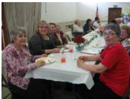
Branch 48's St. Joseph's Table Celebration.

There will be a district meeting May 19, 2013 hosted by Presentation Br. 395 in Stockton at 1515 Benjamin Holt Dr. at 1:30 pm. Cost $8.00 per person.