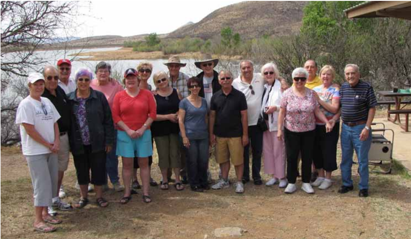
Members of Branch 425 having a great time at Patagonia Lake,

Tucson St. Elizabeth Ann Seton, Br. 434 April 15, 2013 – Happy Easter everyone! Our Tucson branch has been quiet the past couple of weeks following all the events the first part of the year brought us. Today’s news has been covering a bombing that took place today in Boston. We pray for peace. We look to God to wrap his arms around all of us. Given the events of today, I’d like to present the bollettino with the Mano Ponderosa – the Prayer to the Powerful Hand: O Powerful Hand of God I place my Christian soul before you and in my despair and anguish beseech you to aid me with your almighty power. At your feet I place the devotion of my sorrowful heart that I might be delivered from my suffering. May the loving kindness of your power help me and give me strength