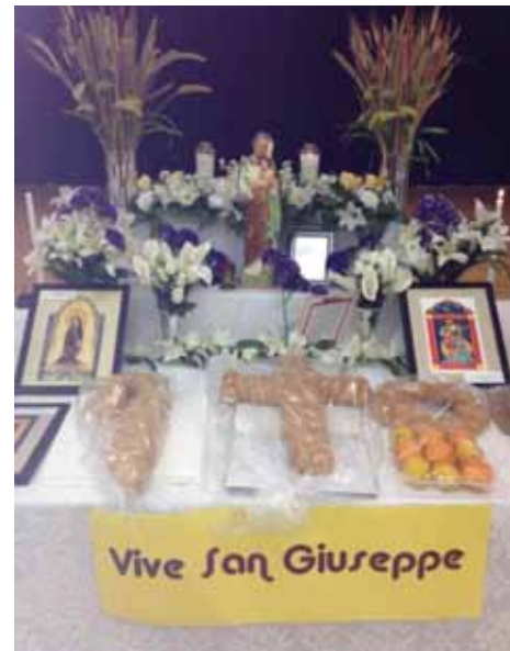
Branch 246 celebrates St. Joseph's Day.