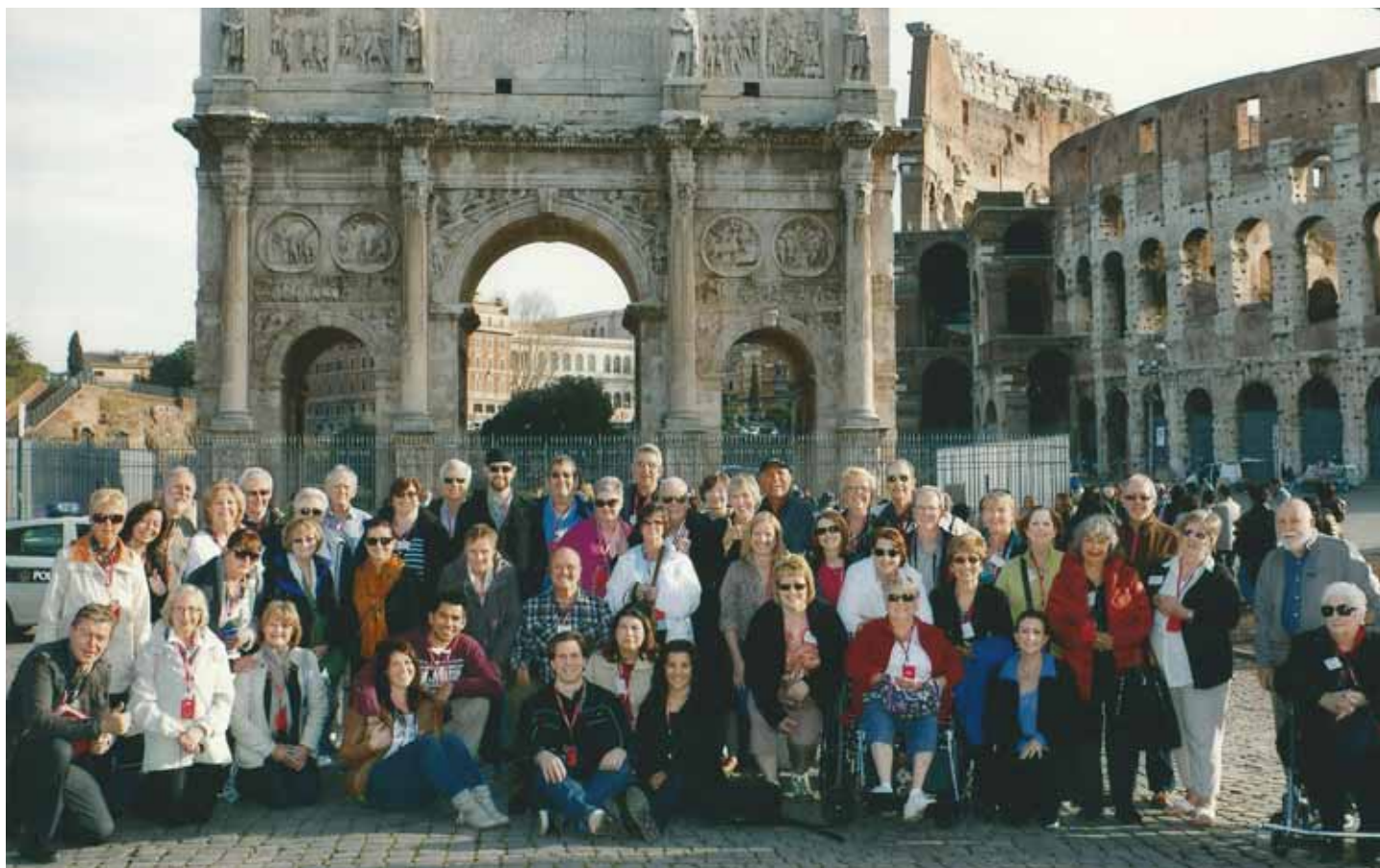
Several members of Branch 380 joined a group of others on a 10-day trip through Italy in April.