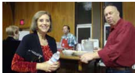
Christmas Cheer, Branch 103

On December 6 th , Branch 209 celebrated its 48 th Anniversary with a Ravioli Dinner. Thanks to all who attended and, also, thanks to everyone who helped make the event a success!!