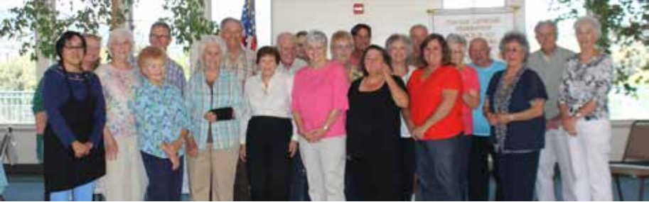
The wonderful volunteers for Branch 21's ICF's 90 th Anniversary.