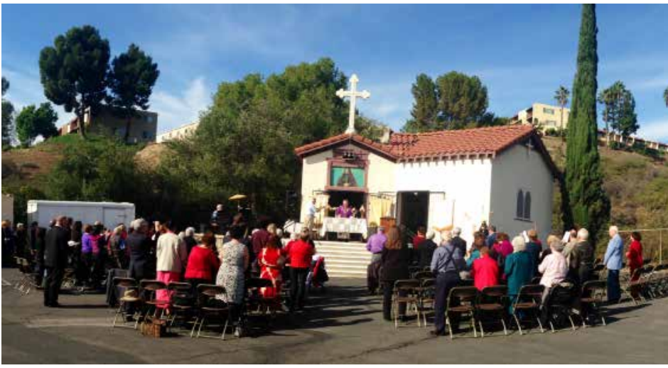
On December 7, 2014 ICF held its annual Mother Cabrini Mass, Pilgrimage and Luncheon at Saint Francis Xavier Church in Burbank. This year was the first time in over 30 years that members processed first to the Chapel for Mass and Benediction.

who attended and all who donated their time to ensure the party's merry success.