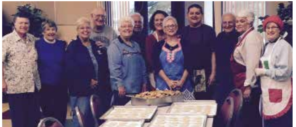
Branch 438, St. Clare Bakers Dozen help ICF Parish Bake Sale.

12:30 am lunch: "Valentine's Day Party,"