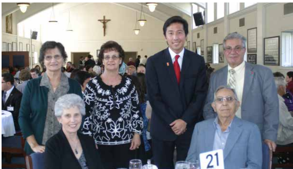
Members of LA Branch 111 at the Annual Bishops Banquet.