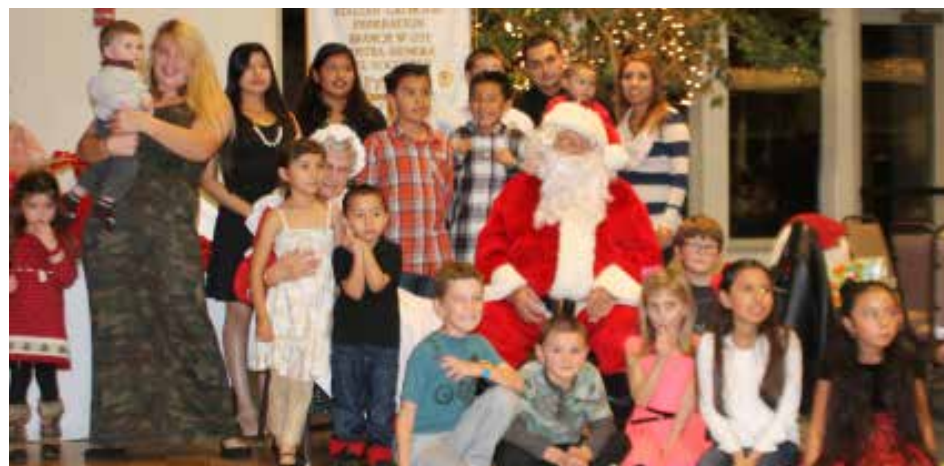
Monterey Branch 21 Santa and Mrs. Claus with children at Branch 21 Christmas Dinner on December 5, 2014.