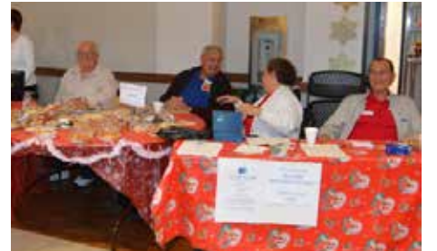
Members of Branch 218 enjoyed time together at their Christmas party and celebration.