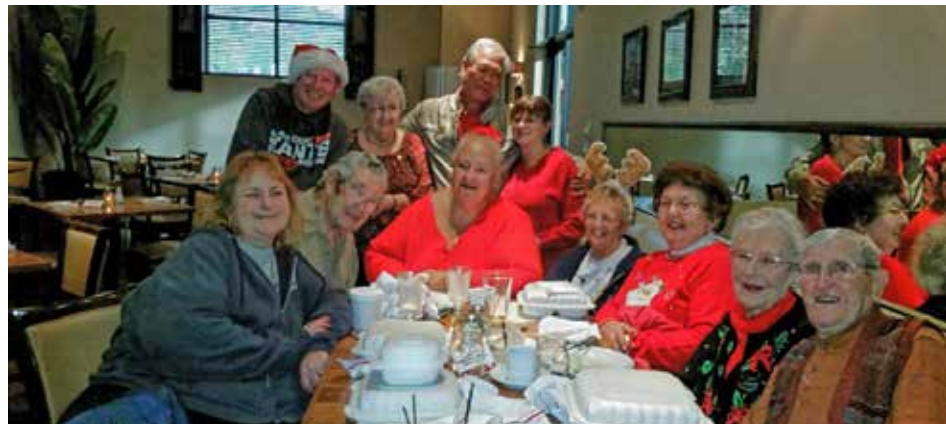
St. Rose ICF Branch 18 members Christmas party.