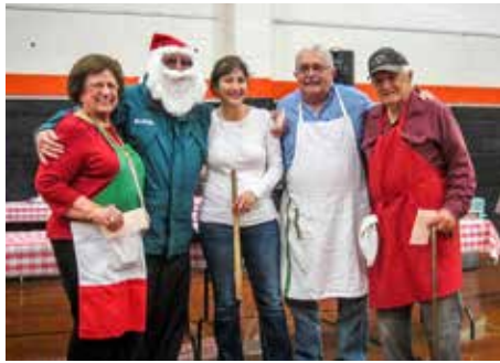
Members of Branch 391 enjoying a festive Christmas dinner.

Our branch wishes your branch a happy, holy, Christmas and a prosperous, fulfilling, New Year!!!