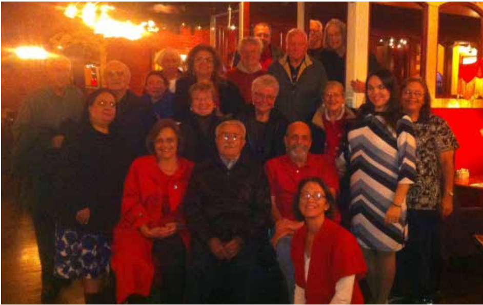
Members of the Contra Costa District enjoyed a festive Christmas party.