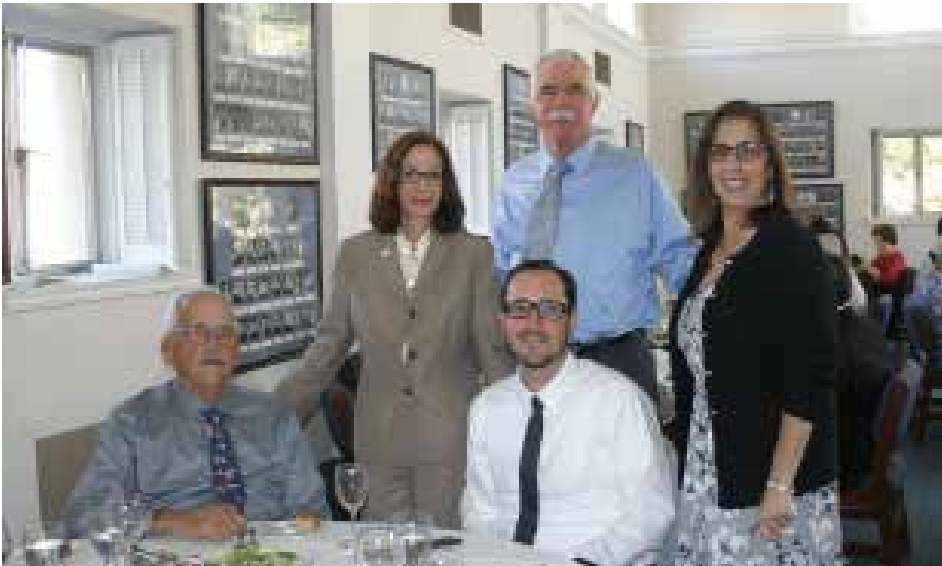
(Above) Branch 237 at the Bishop's Day Celebration.