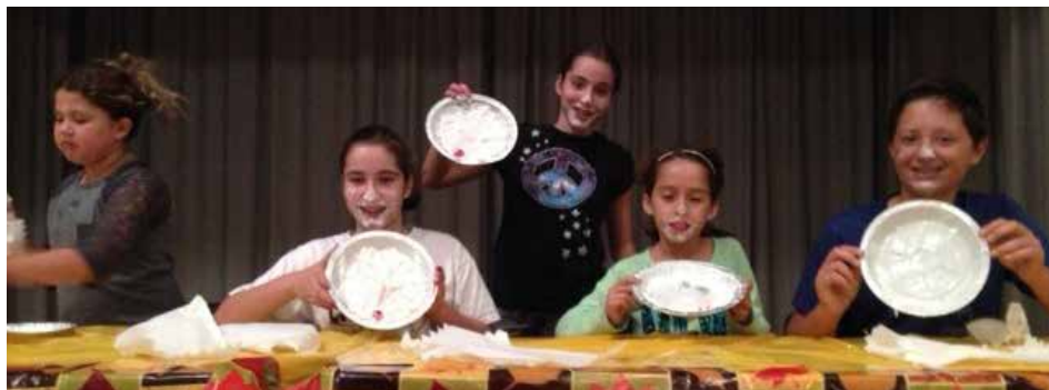
Branch 380's Thanksgiving feast was complete with a pie eating contest!