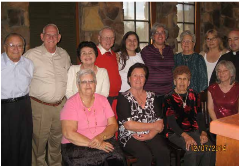
Branch 433 enjoying some Christmas cheer!

ICF Branch 434 participated in the first St Elizabeth Ann Seton Parish Ministry Fair was held October 26, in the parish hall. The event was very well attended. It was inspiring to learn about other parish ministries.