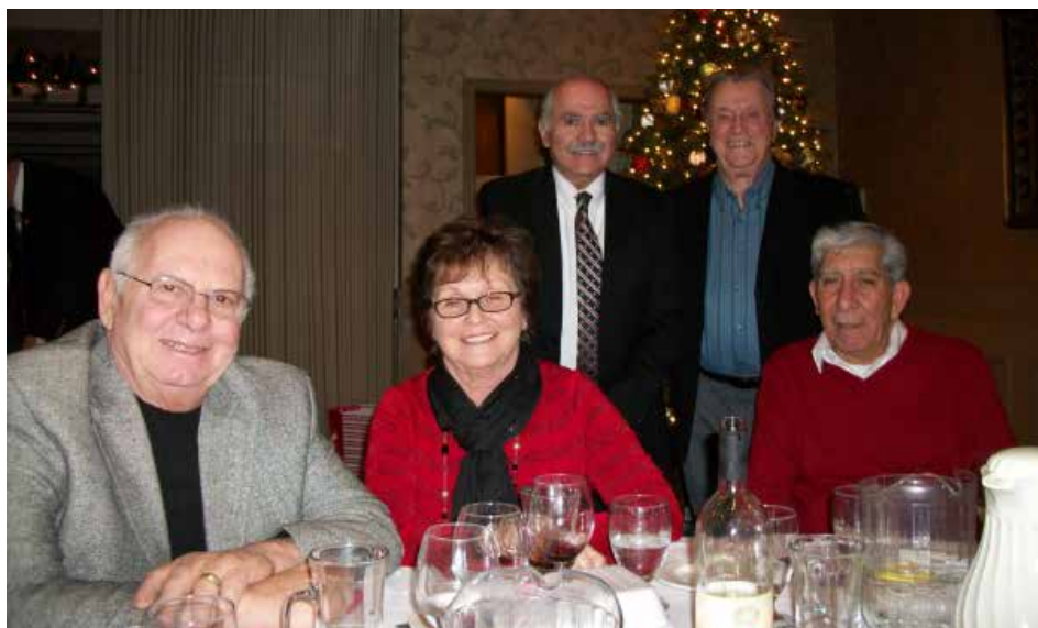
Members of Branch 308, Fresno, enjoyed a festive Christmas celebration.