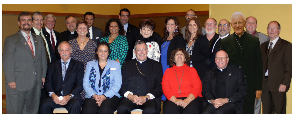
The Los Angeles Bishop's Day and Chaplain Recognition Luncheon was held at the Cathedral of Our Lady of the Angels in the Archdiocese of Los Angeles on November 18.