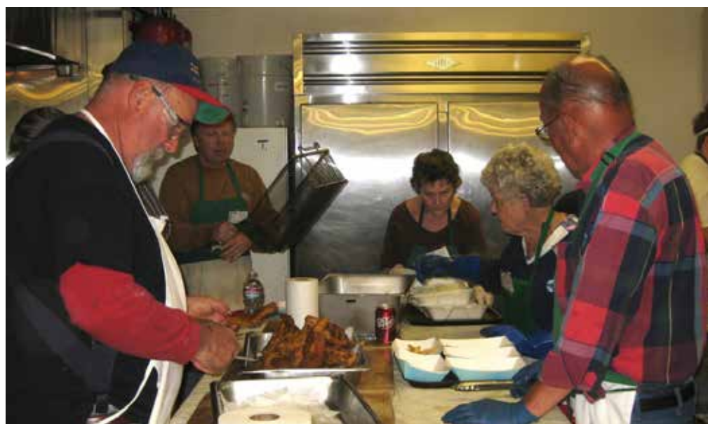
The kitchen crew of Branch 291 hard at work assembling fish dinners for Br. 291's Fish Fries.