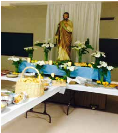
St. Joseph's Table at branch 14 celebration. A great event!