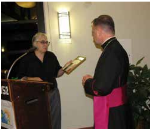
Contra Costa District celebrated it Bishop's Day with Bishop Barber.