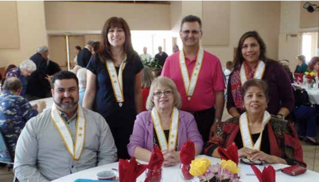
Branch 111 Officers at Annual Los Angeles District 2015 Installation.

On March 15, 2015 - ICF Los Angeles Archdiocese District Communion Sunday was celebrated at