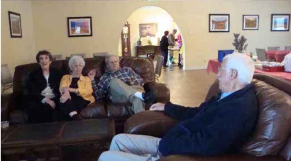
(Below) Social Hour at Branch 103.

“Bingo” Champagne and Desserts and 3 Bingo Cards--all for $10, extra cards 2 for $1, Great Prizes! Reservations, call Margo 707-938-2016