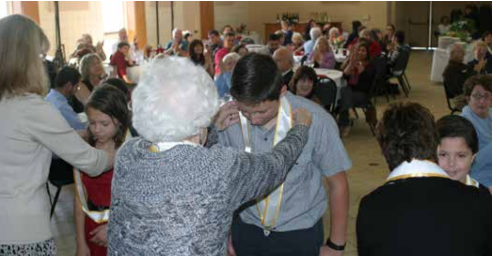
Installation of LA Youth Officers.