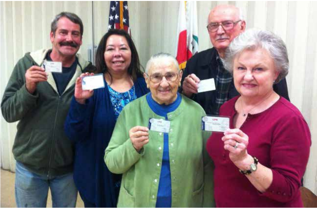
New members from Branch 250.