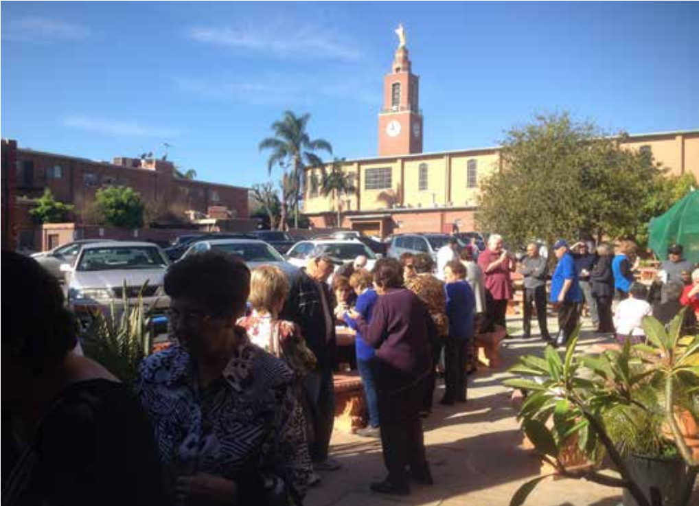
San Pedro Branch 115 celebrated the Feast of Saint John Joseph of the Cross, patron and native of the island of Ischia, Italy. On March 5, an anniversary mass in his honor followed by refreshments. On Saturday March 7 a Crab Dinner-Dance. Over 375 people were served. Lots of food and fun. Thank you to all the volunteers that helped to make it a great success.