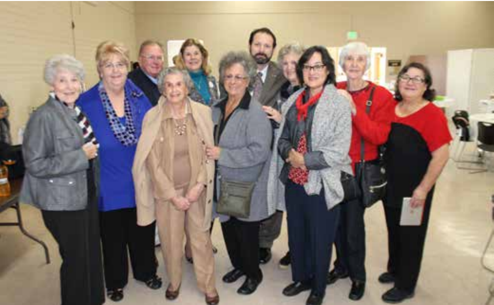
Members of Branch 21 at the Installation of Officers.

04/26 – ARTS AND CRAFT FAIRE AT ST. DENIS