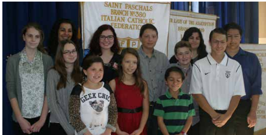
At the Los Angeles Archdiocesan District Installation the Youth and High School Officers and Youth Officer/Childcare Coordinator from Branch 380 were installed.