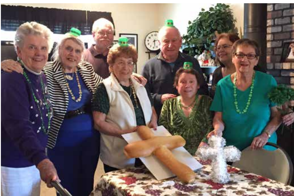
Branch 72, Pittsburg celebrates St. Joseph and St. Patrick's Days.

attend mass at 5:30, then enjoy an adult beverage (or not) and camaraderie, followed by dinner at 6:30, and the meeting at 7:30. We will elect convention delegates, and this year, if Las Vegas has been on your bucket list, you may want to consider being a delegate or attending, just for the fun of it. Remember, what happens in Las.....oh, you know.