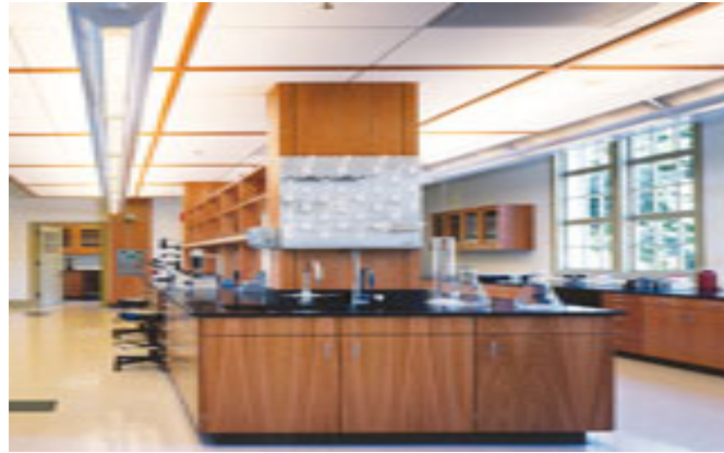
A research laboratory at Children's Hospital of Oakland Research Institute