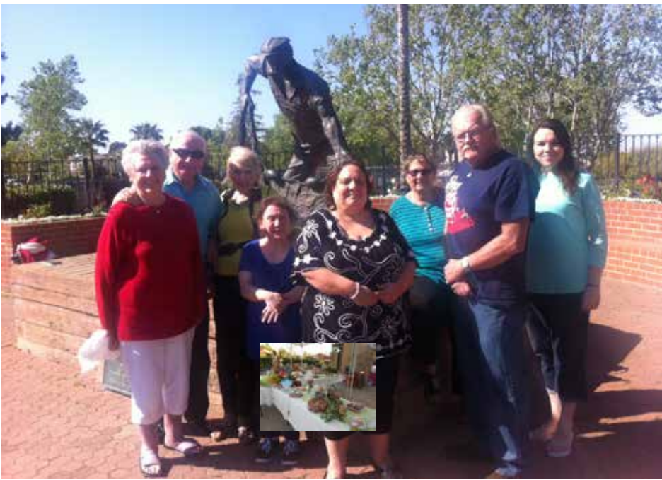
Branch 72 members in front of Pittsburg's sculpture in honor of the Italian fisherman.