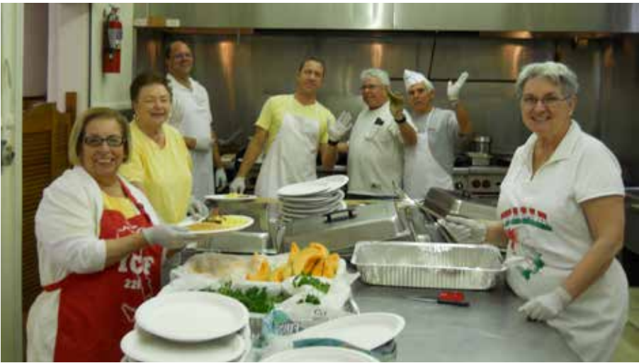
Branch 230 Breakfast Cooks egg it up for Scholarship Fundraiser.

Happy May! Hope you are all enjoying the Springtime!