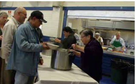
Branch 191 served their famous Minestrone soup to St. Frances Cabrini parishioners and guests at the Lenten weekly soup night.