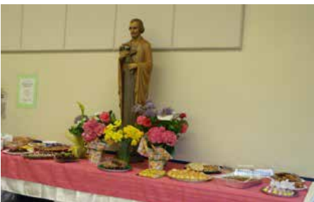
Branch 191's St. Joseph's dessert table.