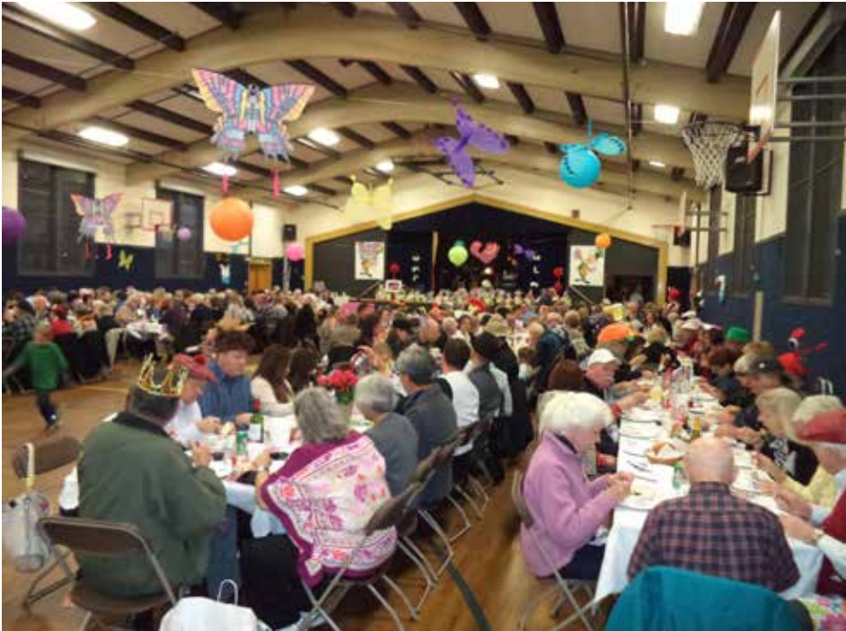
The Guests of Wonderland at the Branch 184 Mad Hatter's Ball.