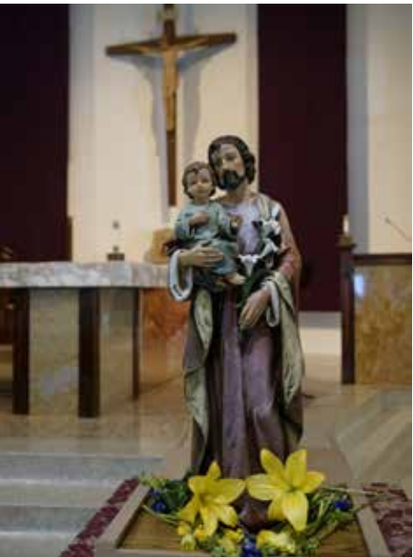
A closer photo of the Br. 229 St. Joseph held at St. Rose of Lima, Chula Vista, CA.