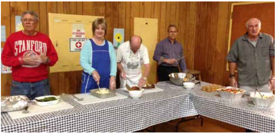
Members of Branch 442 serving a meatloaf dinner to homeless families who stayed at our parish for 2 weeks.