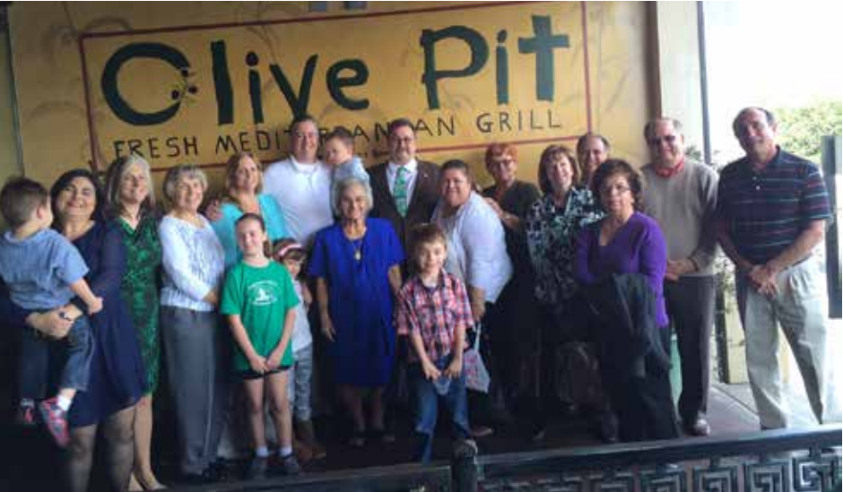
Officers and members of Orange County District enjoyed lunch at the Olive Pit Restaurant after Installation of new officers held at St. Bonaventure Church in Huntington Beach on February 15.

It's not too early to be thinking about making summer plans; especially when it's for a spectacular Branch 45 event. Join us on Sunday, JULY 13, as we host Monte Carlo