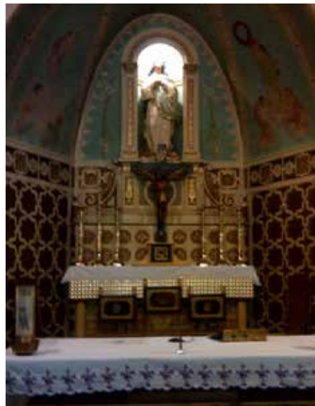
Immaculate Conception Chapel, San Francisco.

Luncheon Celebration includes: Buffet of antipasto; fresh spring salad; spaghetti & meatballs; pasta with shrimp; chicken in cream sauce; & roasted fresh vegetables;