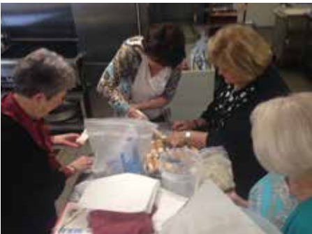
Members of Branch 108 making cannoli.

- May 5, 2014 - Branch 108 Dinner Fundraiser at Jake's Roadhouse BBQ in Old Town Monrovia from 4:00pm to 9:00pm. The Branch General Meeting will be held in the back area of Jake's from 6:00pm to 7:00pm. Families welcome.