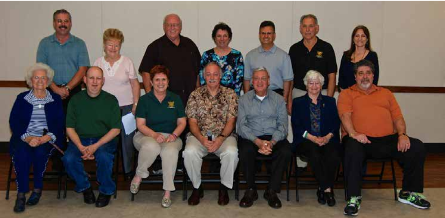
Congratulations to the newly installed officers of the LA Archdiocese District Council.

Our Installation of Officers took place on ry-one a Happy Easter, Buona Pasqua!