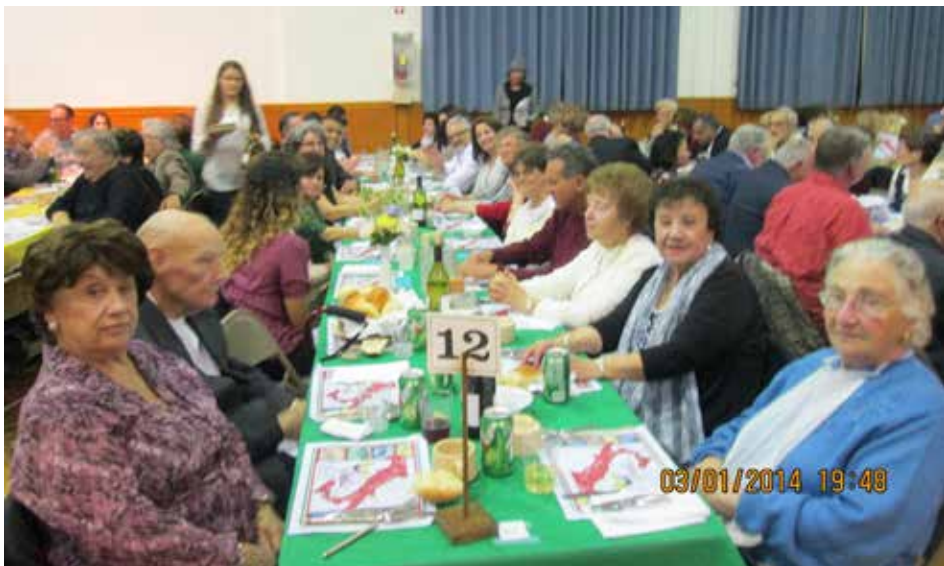
Branch 115 Crab Dinner-Dance was a great success serving 400 people. An enjoyable evening with good food, music and fun. The dinner has been an annual tradition for the past 28 years.