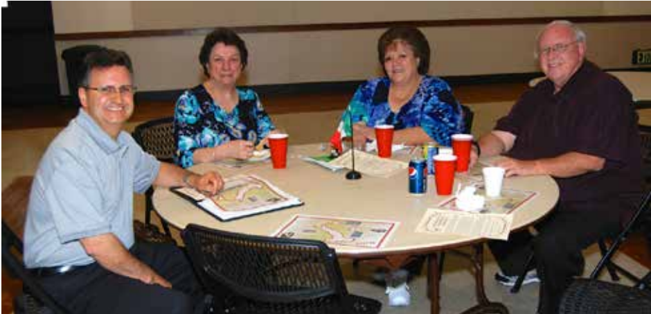
Members of the LA District at the installation of officers.

Chapel Library to pick up souvenirs to bring back to her mother in New York.