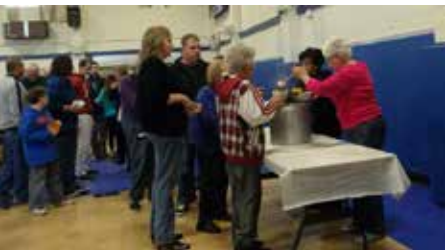
Branch 191 served their famous Minestrone soup to St. Frances Cabrini parishioners and guests at the Lenten weekly soup night.