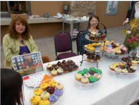
Branch 423's St. Joseph's Table.