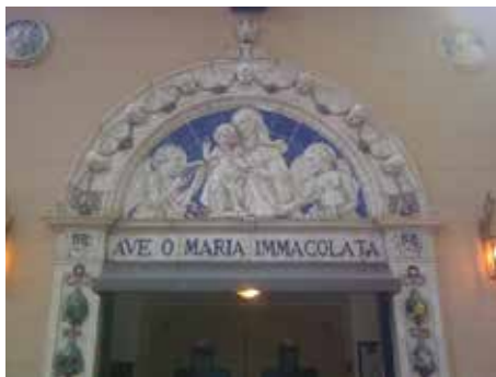
Immaculate Conception Chapel, San Francisco.