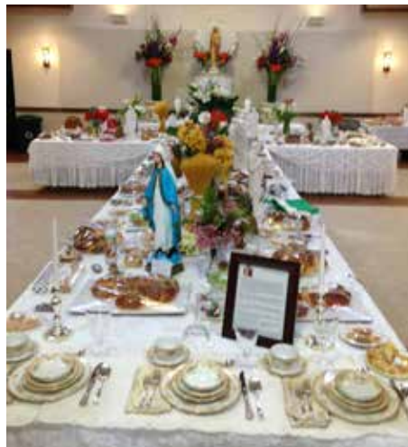
Branch 218's St. Joseph's Table.