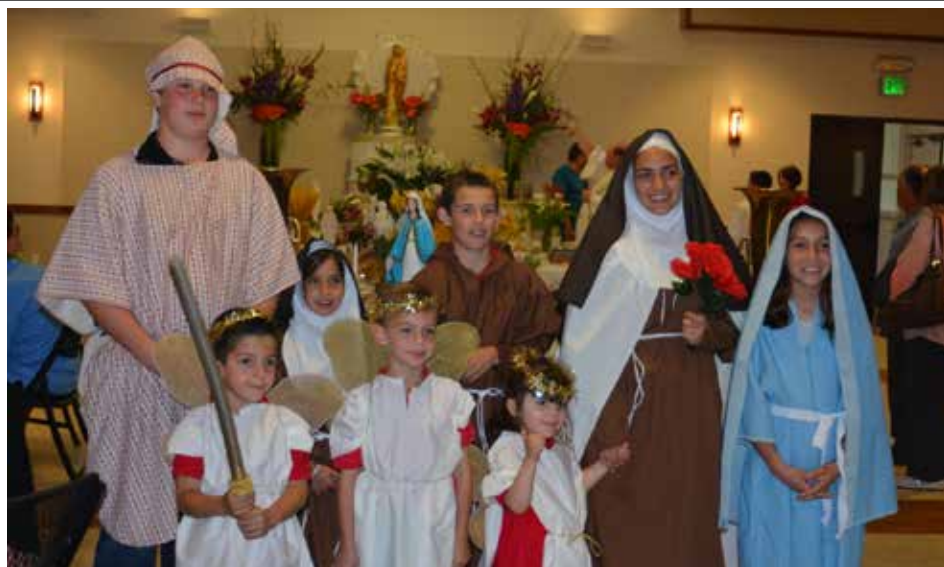
Branch 218 Junior ICF!!