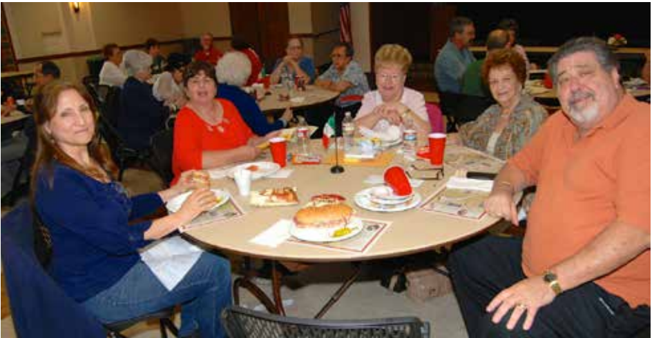
Members of the LA District at the installation of officers.