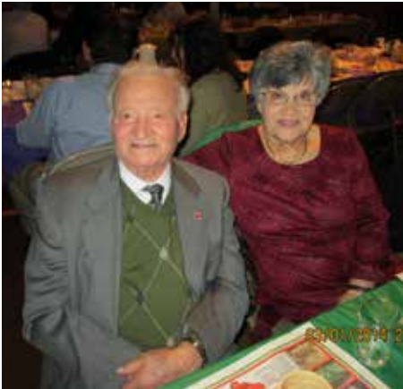
Members of Branch 115 attending the Crab Dinner-Dance.

Happy Mother's Day to all our Mothers. God Bless them!