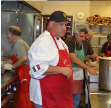
Members of Branch 36 helped to make the annual Lenten Fish Frys a huge success!