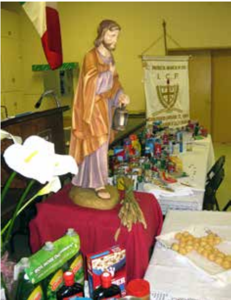
Branch 291 celebrated St. Joseph's Day at our March meeting with a beautiful St. Joseph's Table. All food was donated to St. Patrick's Outreach Program.