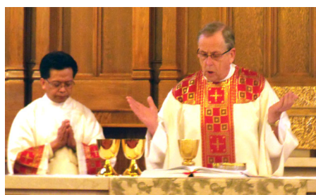
Conta Costa District Installation, held on Saturday, January 29, 2011 at St. Catherine of Siena Parish in Martinez.