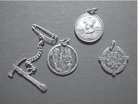
Jubilee Souvenirs, the first two dated 1950, third one 1975 and the last one 2000.

Did you know in Sicily several weeks before a religious or secular festival you would find the elderly grandmothers and aunts baking and supervising the making of many Sicilian sweets? It was the Arabs around 1200 who taught the convent nuns the art of making marzipan and cassata. Today the preparation is considered too complex and laborious, so very few people get around to making them at home. The young Sicilians prefer to go to the pastry shops for their sweets. Many recipes that belonged to the tradition of Sicilian sweets have been lost due to the recent competition of industrial pastry production.