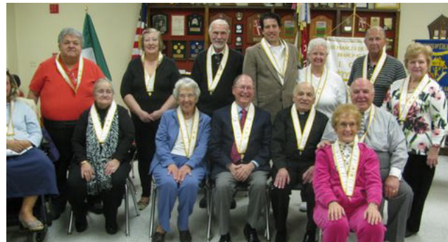
Las Vegas Installation of Officers.