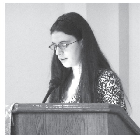
The Santa Rosa District Installation of Officers held on January 30, 2011.