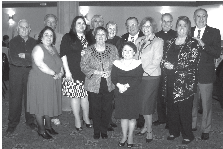
San Gabriel Valley District Installation