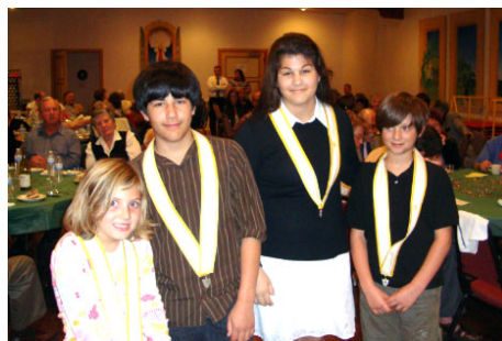
Youth members being installed at the Santa Barbara/Ventura District Installation.