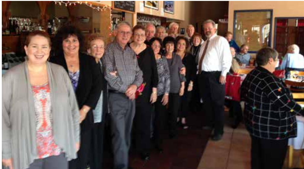
Members from Branch 14 ,Crockett at a branch Communion and Breakfast day at St Rose church .