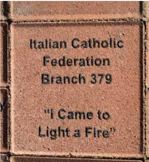
(Above) Branch 379 - Brick: Branch 379’s brick in Mary’s Courtyard at St. Bonaventure Catholic School.

(Left) Branch 379 - Marys Courtyard: St. Bonaventure School is selling engraved bricks in its inner courtyard to increase its Endowment Fund.