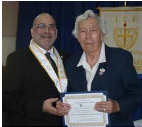
Santa Barbara/Ventura Regio received a Certificate of Merit for 100% Apostolic Charity Participation.