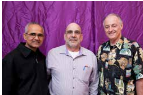
Members, parishioners and Central Council members enjoyed the Branch 108 12th Annual Wine Tasting Event.

At the last General Meeting on February 1,