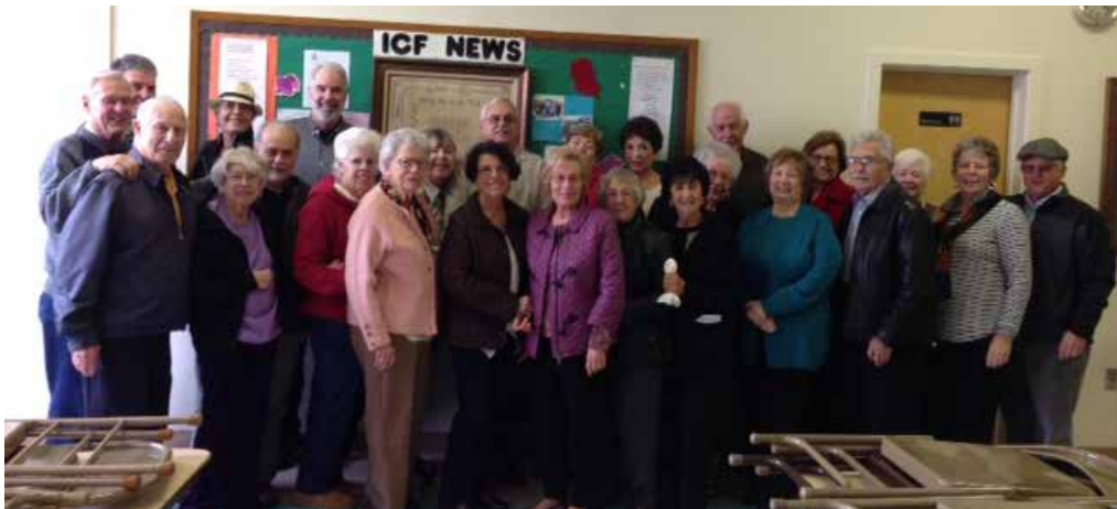
Officers and members from Branch 14 , Crockett at the District Installation in Concord.

The ICF Contra Costa and East Bay Districts