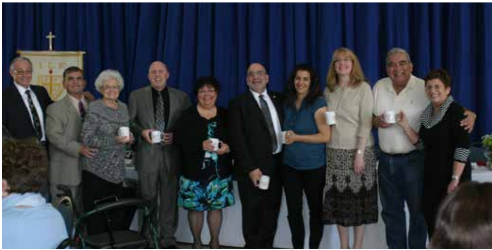
The LA District gave Mother Cabrini mugs to Central Council Members at the installation.