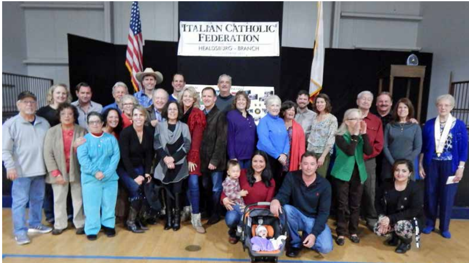
The newest members of Branch 52, Healdsburg, were initiated at their Polenta Dinner.