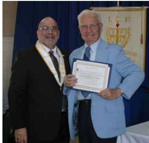
San Fernando Region received a Certificate for 100% Scholarship Participation from the Grand President at the installation.