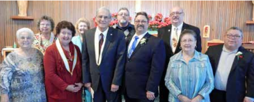
Santa Rosa District Installation