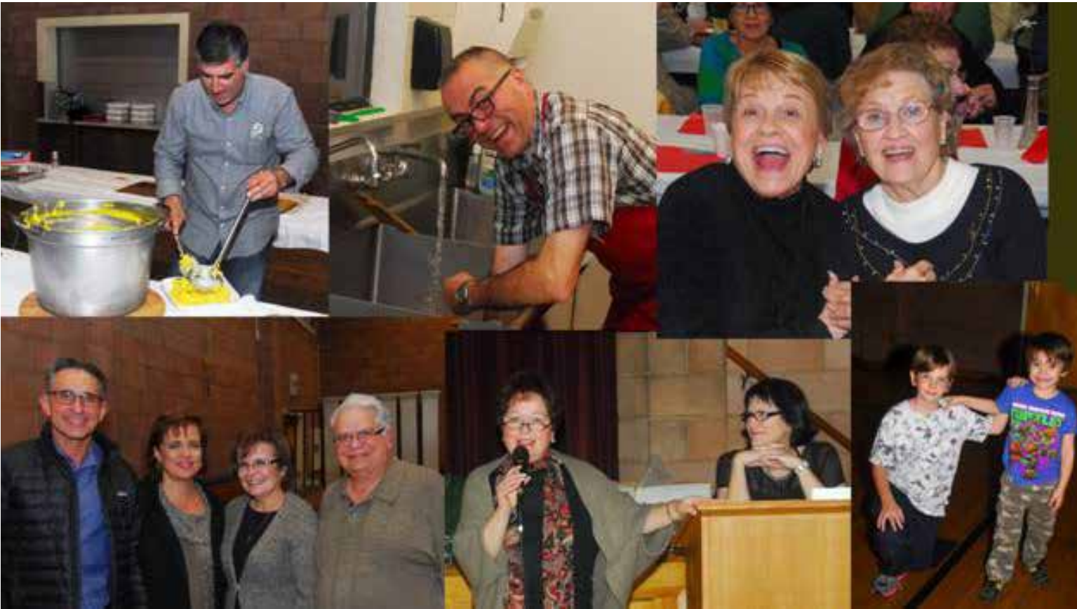
Photos taken at the Branch 390 January dinner meeting - captions are as follows left to right top row: