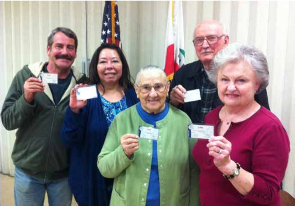
Members of Branch 250 who took CPR Training to learn to use the defibrillator in the Parish Hall.

We’re looking forward to when they are able to be back with us again.