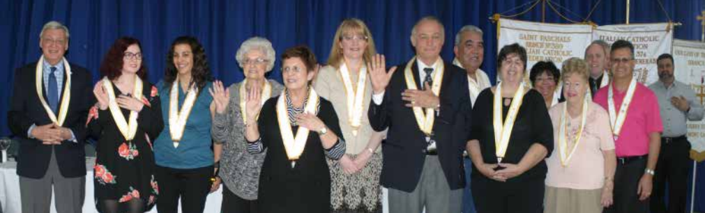
Los Angeles Archdiocese District Installation