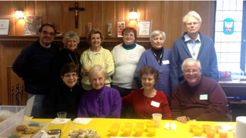
Branch 358 celebrating Mimosa Sunday at our St. Vincent Ferrer Church.