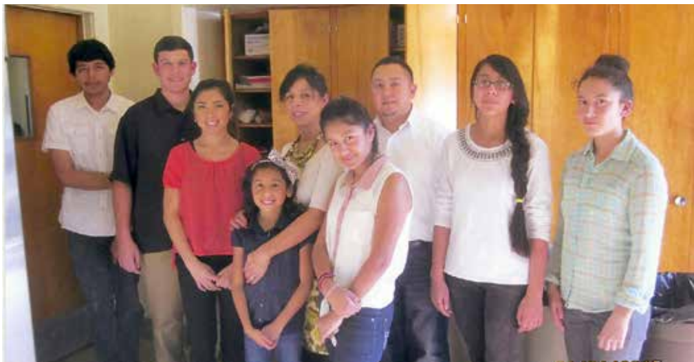
Youth Installation -- Branch 75, Cloverdale's youth group that served at the Santa Rosa District Installation.

members, 19 of whom are children. Welcome to Branch 52.