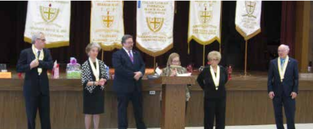
San Diego District Installation