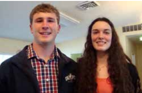
Branch 103 Scholarship winners.