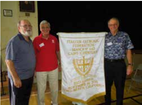
Branch 440 hosted the Los Angeles District Council and the Strategic Planning meetings.