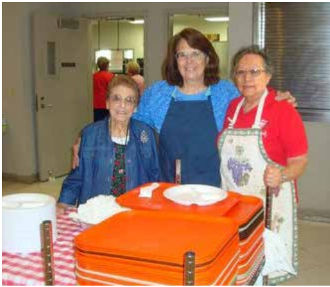
Members of Branch 326 at the Pancake Breakfast.