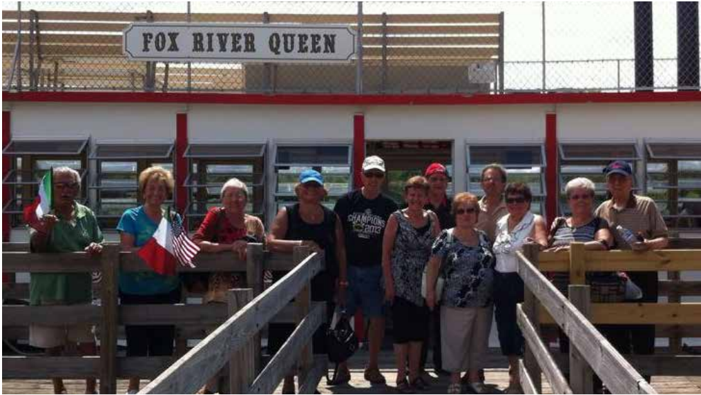
Members of Br. 418 enjoying a picnic and cruise at Pottawatomie Park in St. Charles. A beautiful day enjoyed by all!

Madison-Meadow park in Lombard. Contact any of our officer’s for more info.