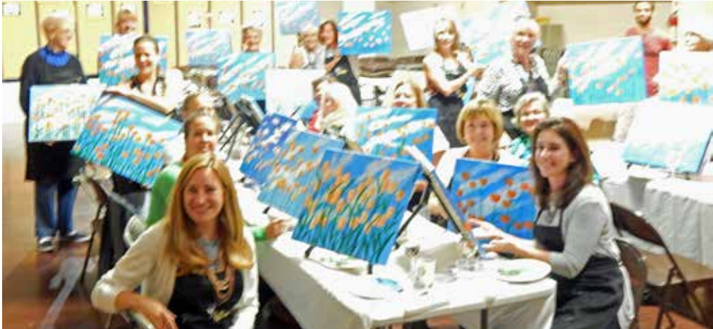
Branch 52’s budding Van Gogh’s show off their painting creations, which were crated after a fun night of painting, wine and socializing!