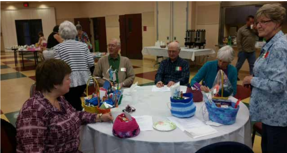
Making spring baskets. Br.#438 members assembling spring baskets for Chemo patients and dialysis patients.