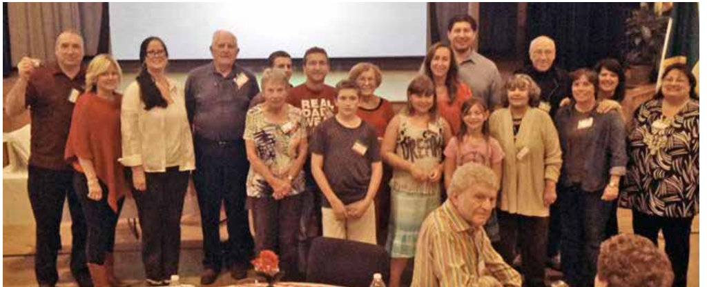
Branch 380 was fortunate to initiate 18 new members at its last meeting. Welcome everyone!