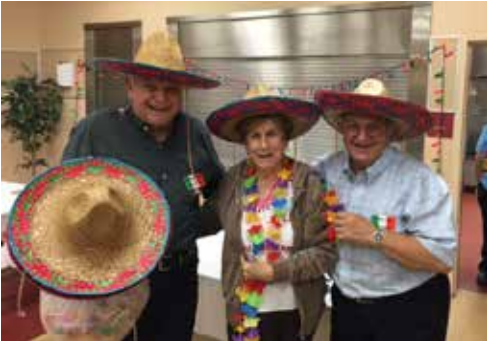
Members from Br. 438 enjoying our Cinco De Mayo dinner and meeting.