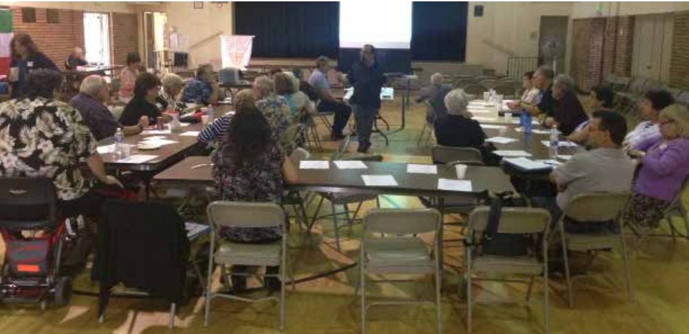
LA Region hosted a recent Strategic Planning meeting.