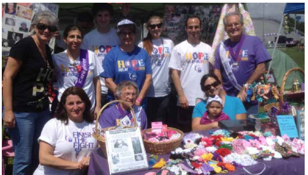
Branch 115-San Pedro participated at the American Cancer Society Relay For Life fundraiser at the San Pedro High School on May 16, 2015.