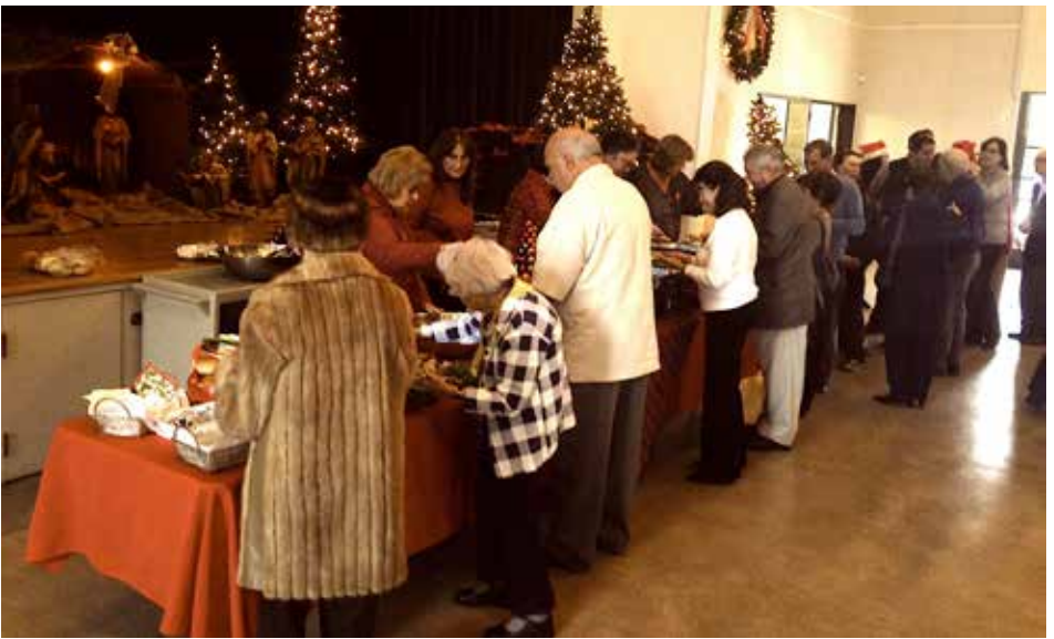
Members of Branch 108 celebrating Christmas together.