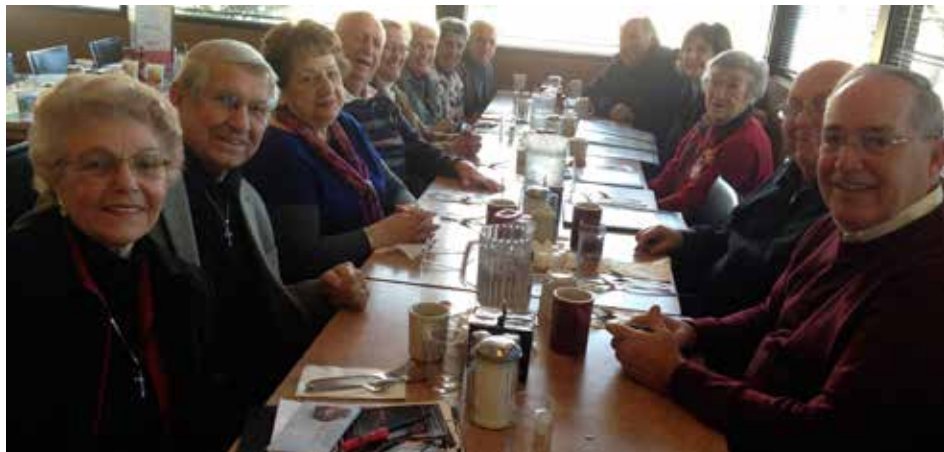
Members of Br. 391 enjoy breakfast together as an ICF "family" after their quarterly communion.