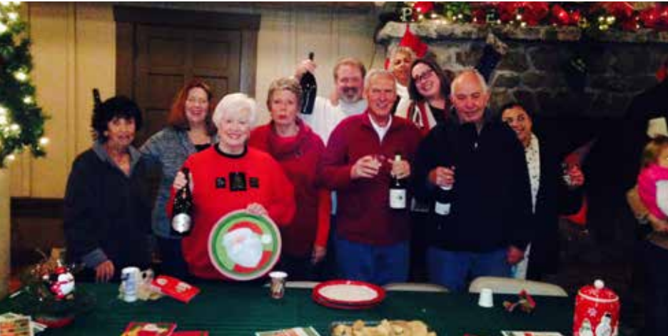
(Below) Members from Crockett Branch 14 bringing in the cheer to all at the towns Christmas gathering.