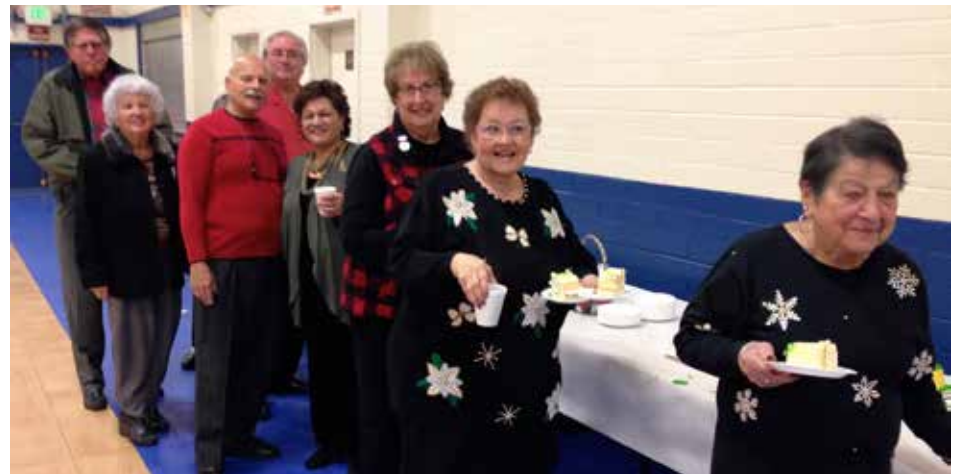
(Below) The dessert line for Santa Clara Valley District's Christmas dinner. We wish all of you a very Happy New Year.