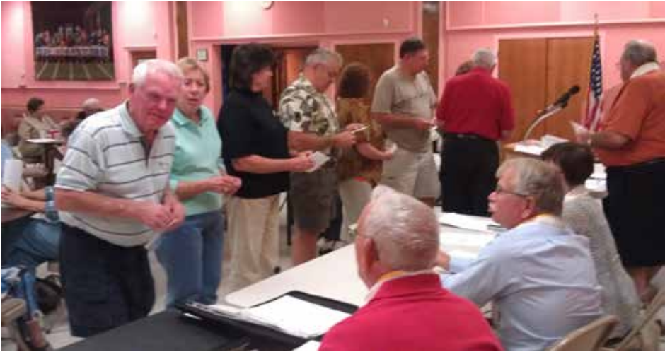
Branch 425 initiated new members at its meeting. Welcome one and all!

Our next fundraiser will be the "All you can eat Shrimp Dinner" on April 26, 2014. Save the date!