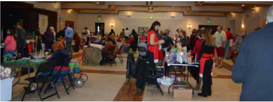
Branch 218 Holiday Boutique.

There will be a donut sale Sunday, January 12, 2014. We will be hold our annual Pancake Breakfast on Sunday, January 26, 2014 6am--3pm. We will be setting up for the breakfast on Saturday, January 25. Looking forward to seeing you there.