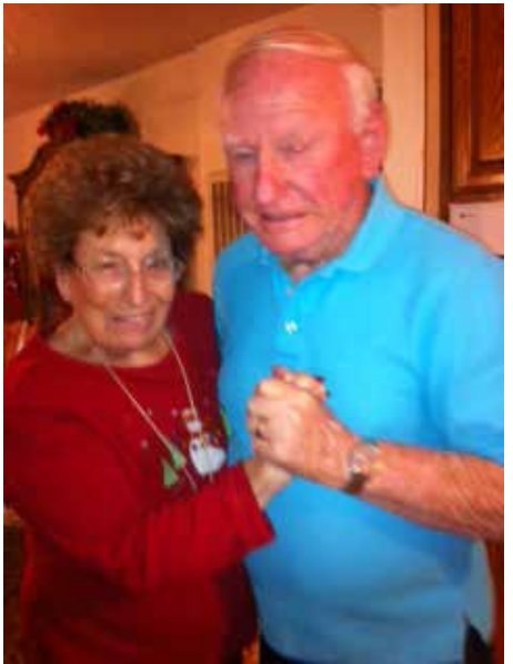
Members enjoying themselves at the Branch 72 Christmas party.