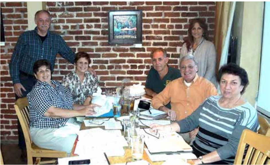
LA District Committee Meeting at Gales Italian Restaurant.

can do all things in Him who strengthens me.” On December 19 members celebrated Christmas at Branch 108 in South Pasadena. Thank you members for making this a fun filled event. Even Santa stopped by to wish all a Merry Christmas.