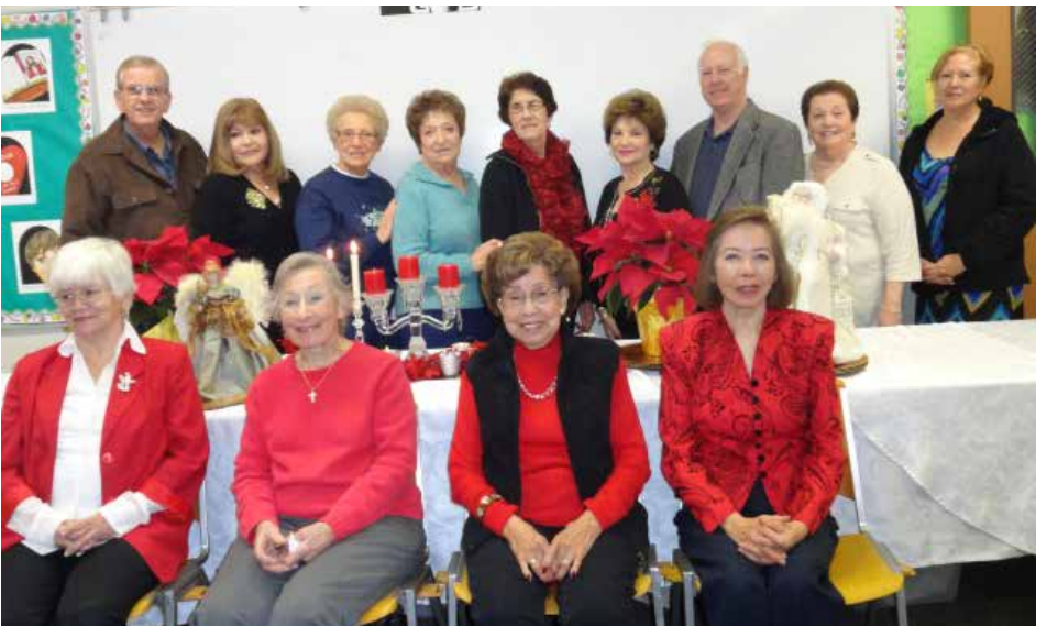
Members of Branch 317 celebrated Christmas at its December meeting.