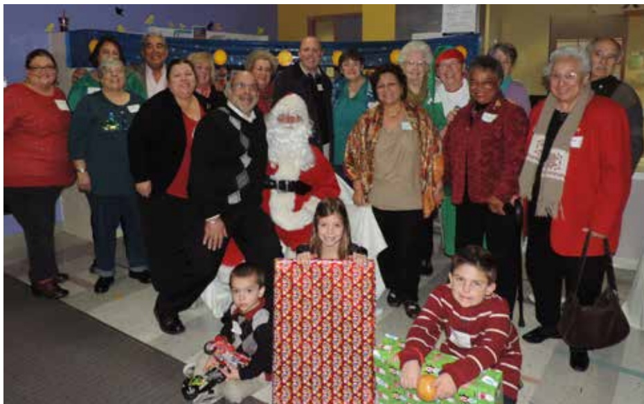
Members of the ICF that attended had the opportunity to take a picture together with Santa, and the children showed off their gifts.